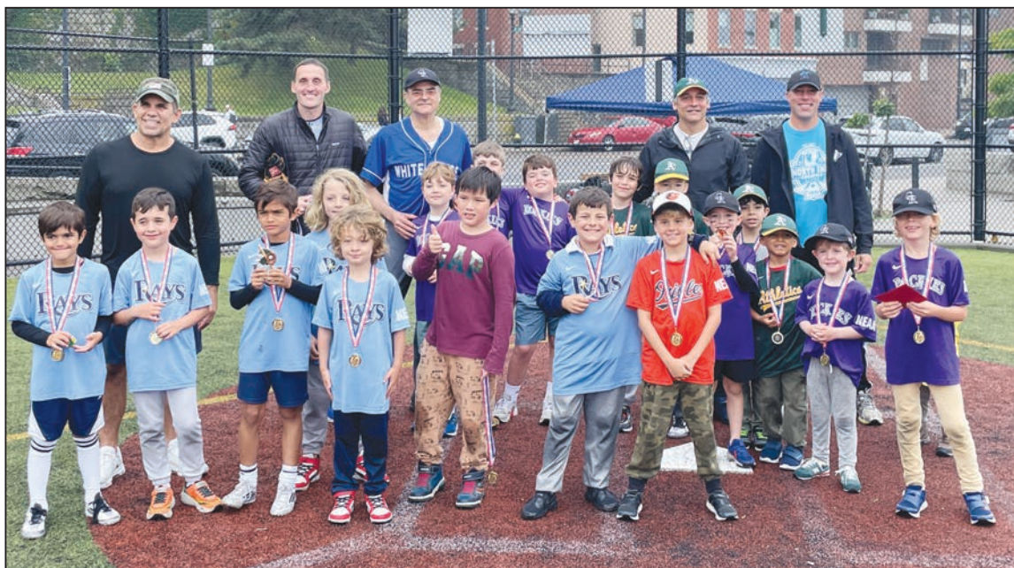
Minor League players with their coaches and medals.