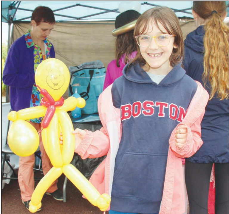
You can't help but smile with an animal balloon.