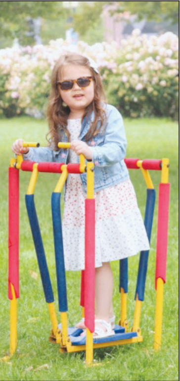
Moving on to yet another lawn game.