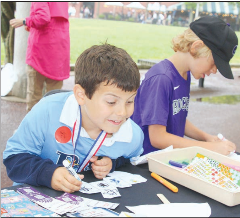
Area children enjoying the crafts table.