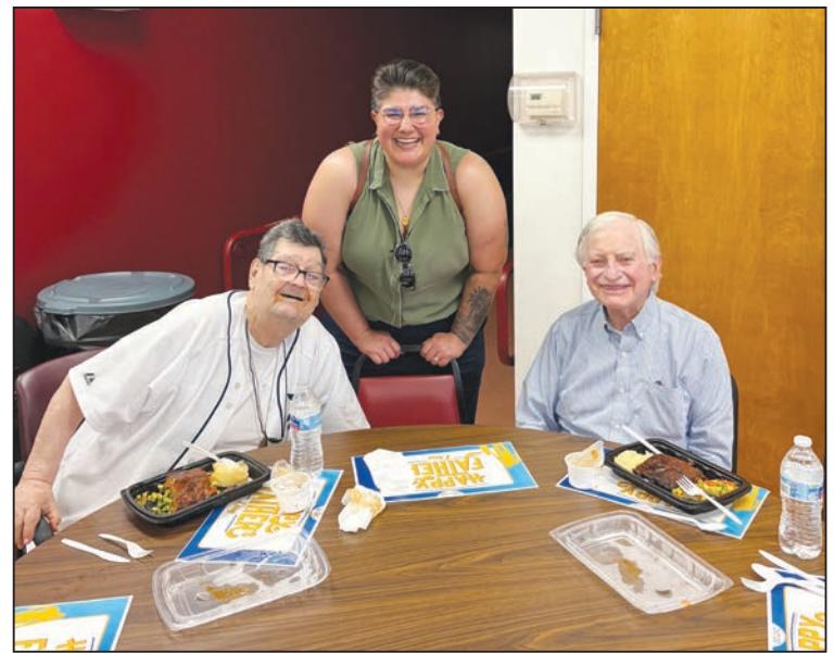
Seniors were treated to a delicious rib lunch with potatoes and vegetables, served with care and gratitude for the many ways that they have nurtured and supported their families and neighborhoods over the years.