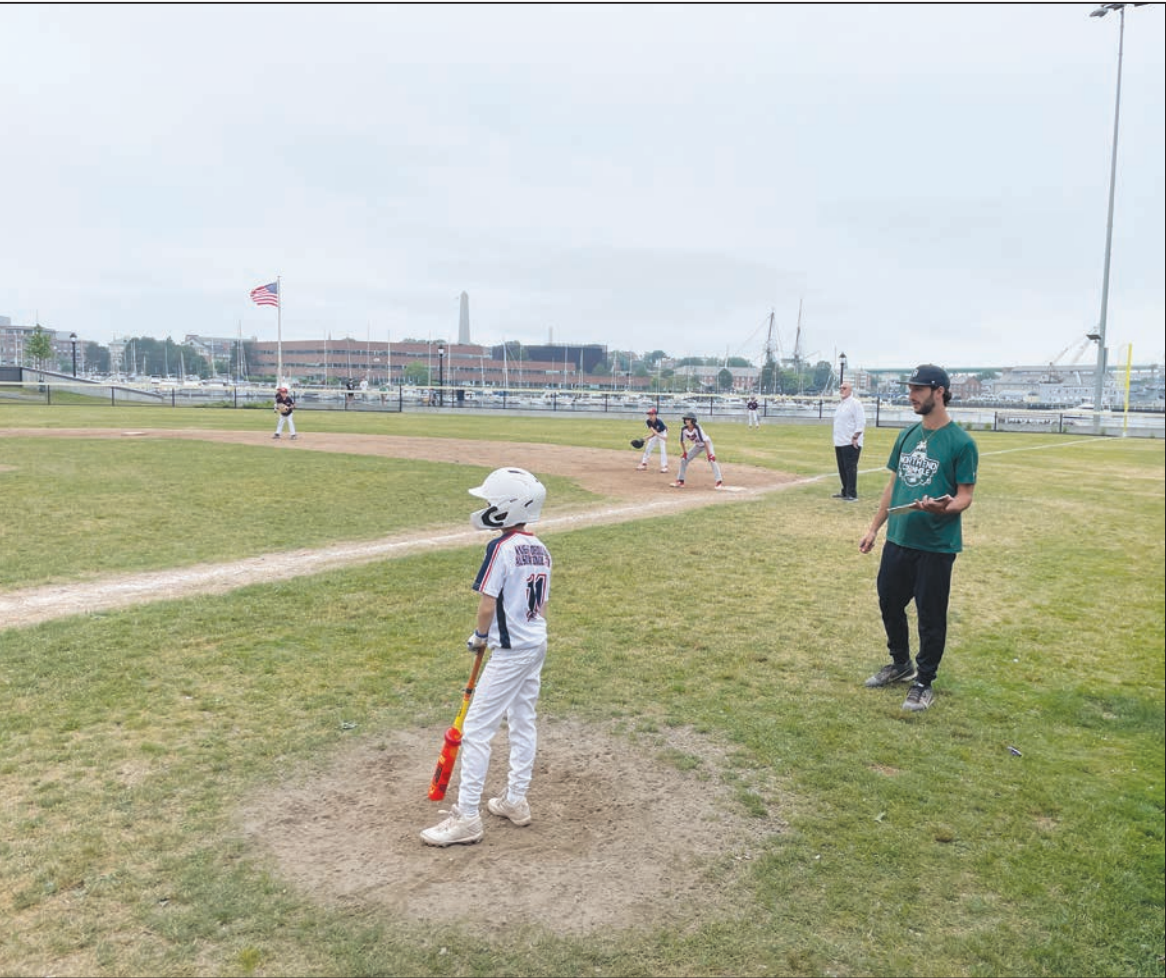
A scene from the final games of the The North End Athletic Association's 2025 Baseball season.