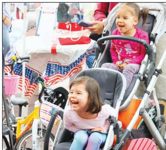
Everyone enjoyed the entertainment provided.