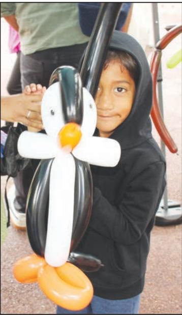
A Penguin balloon.