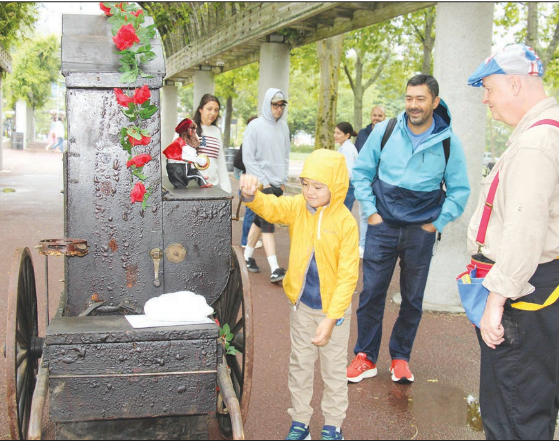
A young organ grinder.