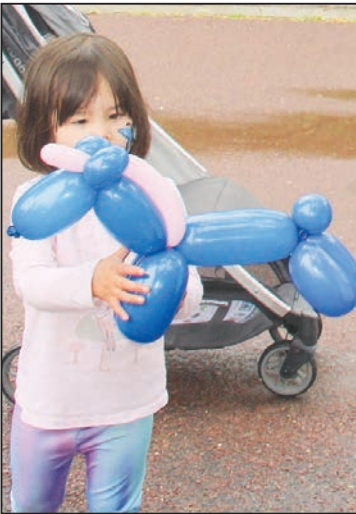
Local child admiring a balloon dog.