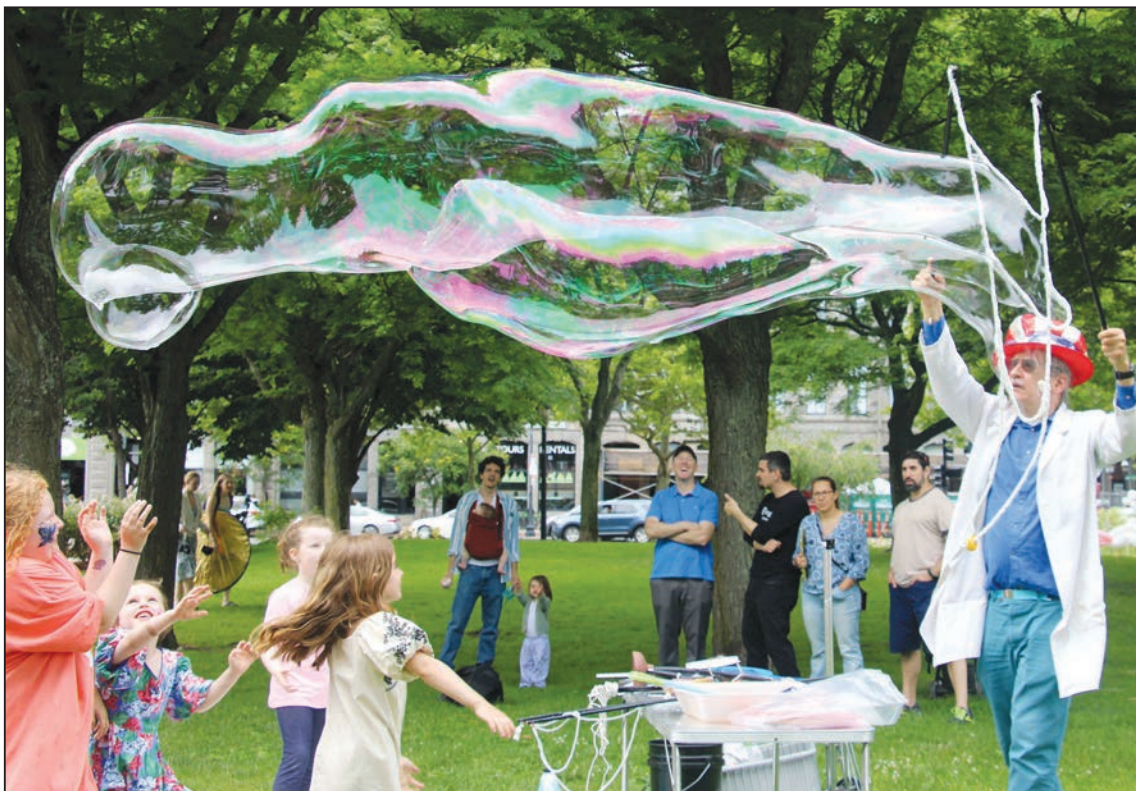
The Bubble Guy always popular.