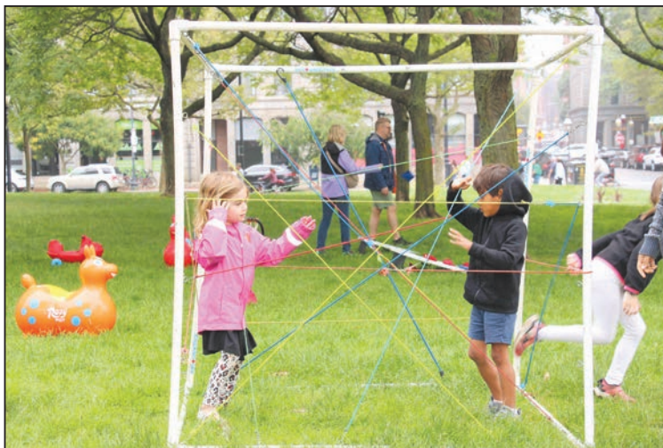
The string maze was one of many lawn games.