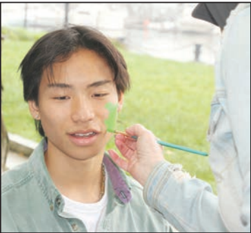
Having fun at the face painting booth.

The Friends of Christopher Columbus Park hosted a fun family event filled with magic, crafts, giant bubbles, lawn games and so much more