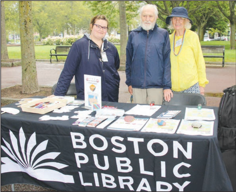
Boston Public Library's booth.