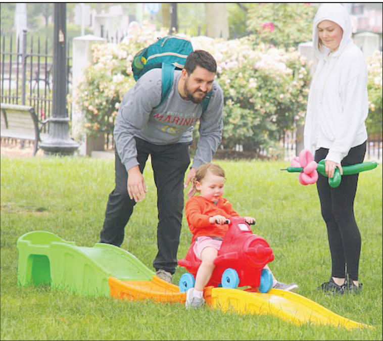
Lawn games for all ages.