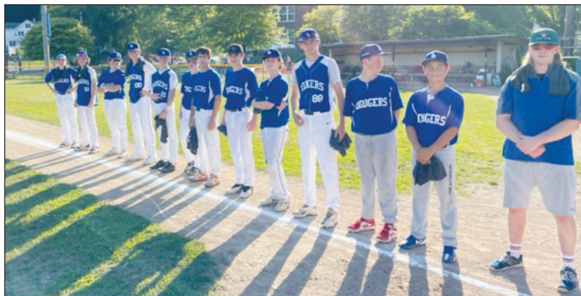
The NEAA Dodgers.