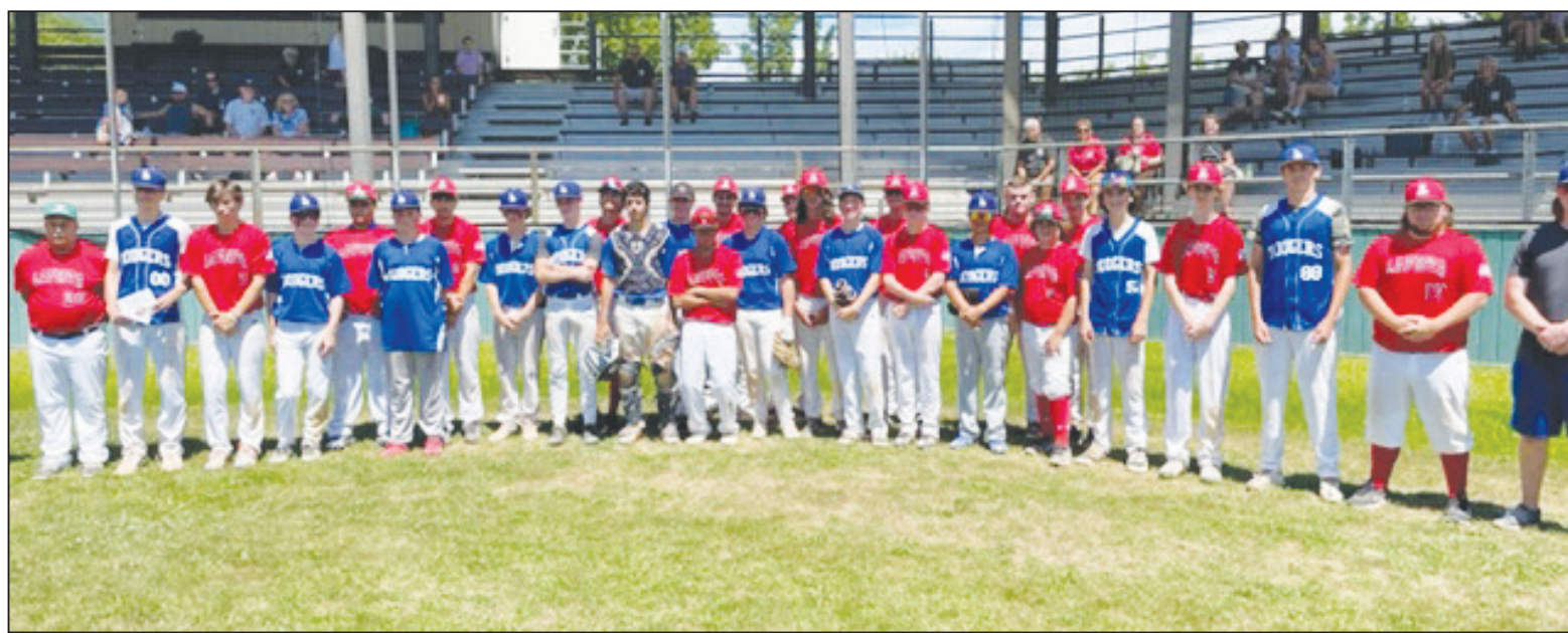
The NEAA Dodgers and the North Adams Allstars at Joe Wolf Field.