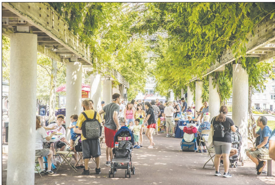
The canopy at Christopher Columbus Park provided shelter from the heat for the attendees at Family Pride Day, hosted by North End Against Drugs at Christopher Columbus Park. See Pages 6 and 7 for more photos.