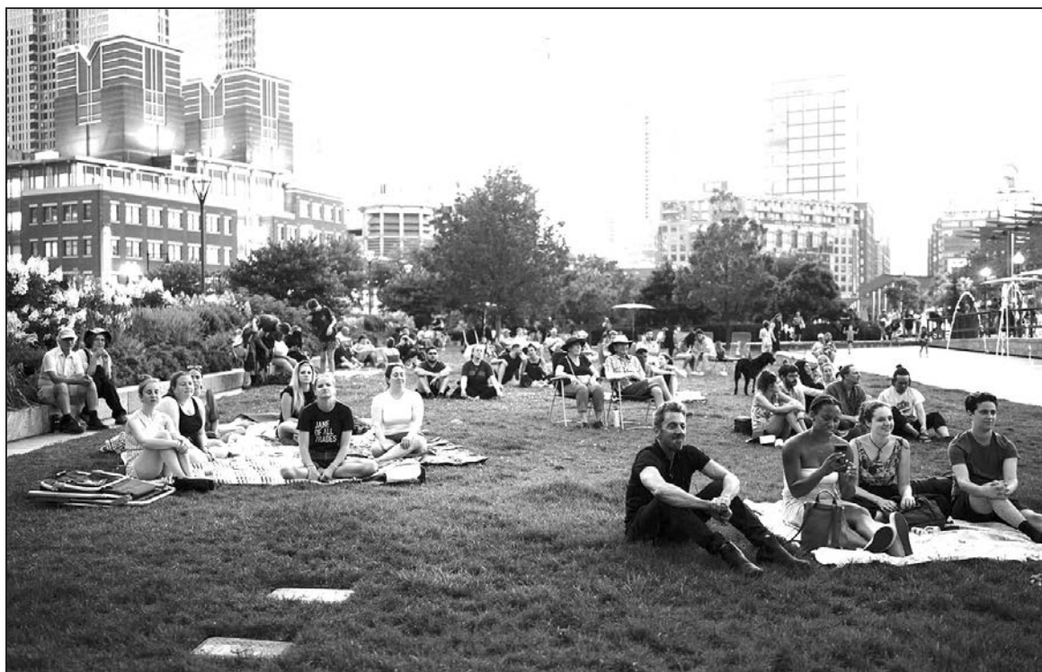
Attendees of NEMPAC's Jazz in the Park" Summer Concert Series fill the lawn of the Rose Kennedy Greenway.