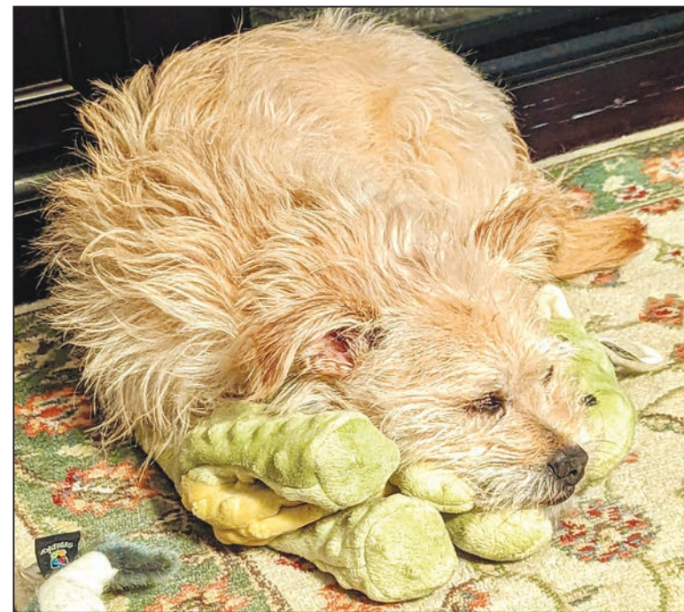
Finley has settled into life in his new home. However, he has only bonded with the female half of the couple.

Many dogs are excellent therapy dogs because they love the attention (and treats) they receive from the people they visit. They may also love being part of a special team with their therapy partner. The male half of our couple has made therapy dog visits with their last two dogs. We have suggested that they try this out with Finley. They live in a senior community, making it easy for them to test this activity. They still have the