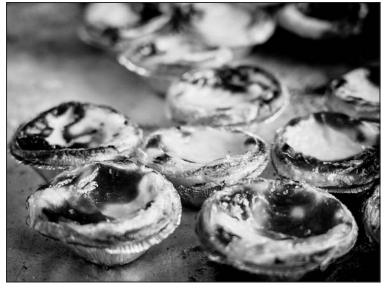
Portuguese pastéis de nata (custard tarts) are one of our favorite Portuguese food icons. Flake in Brookline makes great ones.