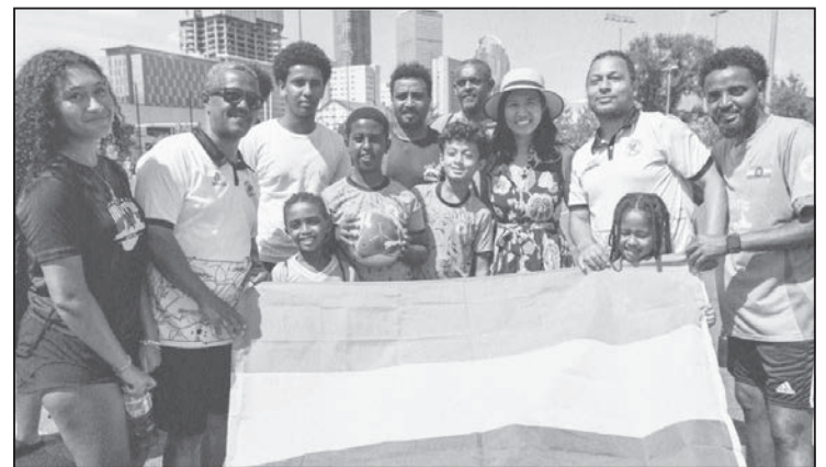
Residents are getting ready for their watch parties this summer.