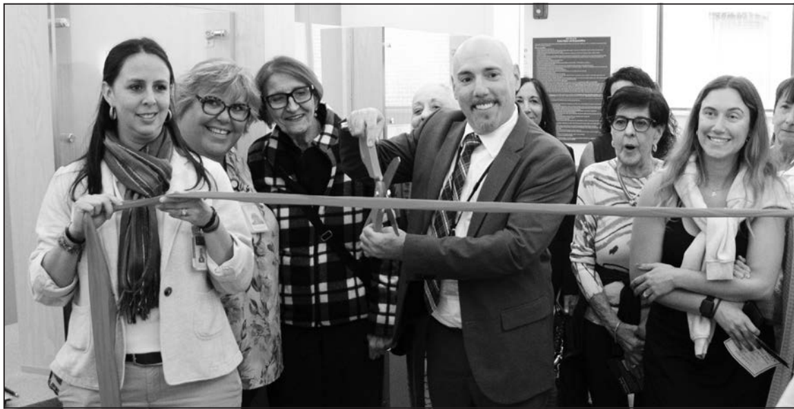
NEW Health recently held a ribbon cutting ceremony to celebrate their new 2nd floor expansion and 55th anniversary.