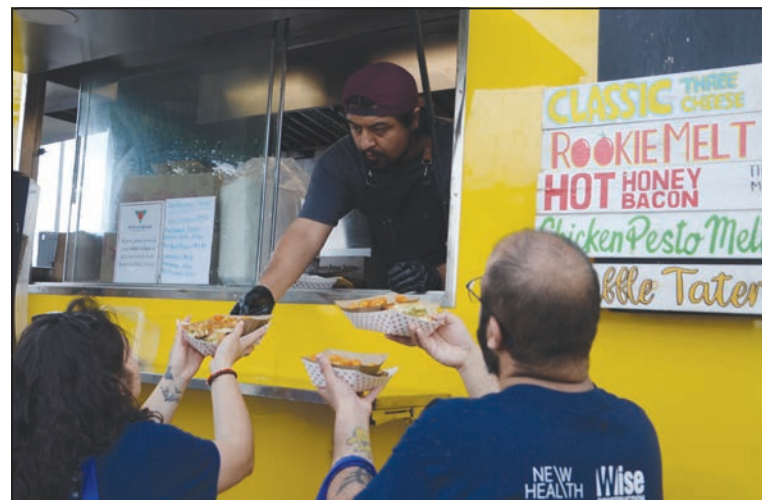
Roxy’s Grilled Cheese provided lunch for the players and volunteers.