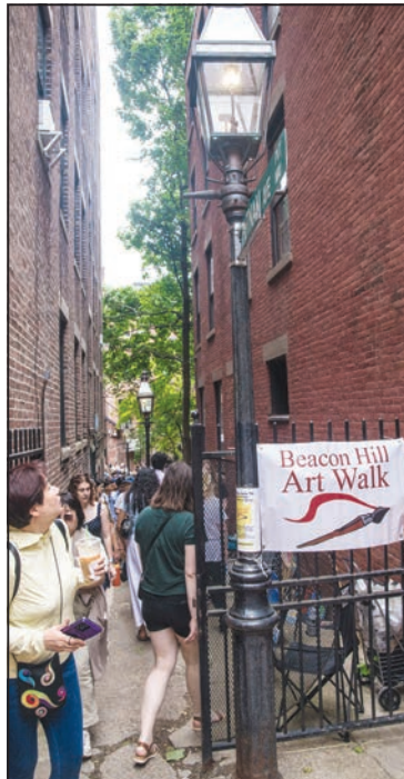
Art Walk visitors continue their exploration from the Putnam Ave alley.