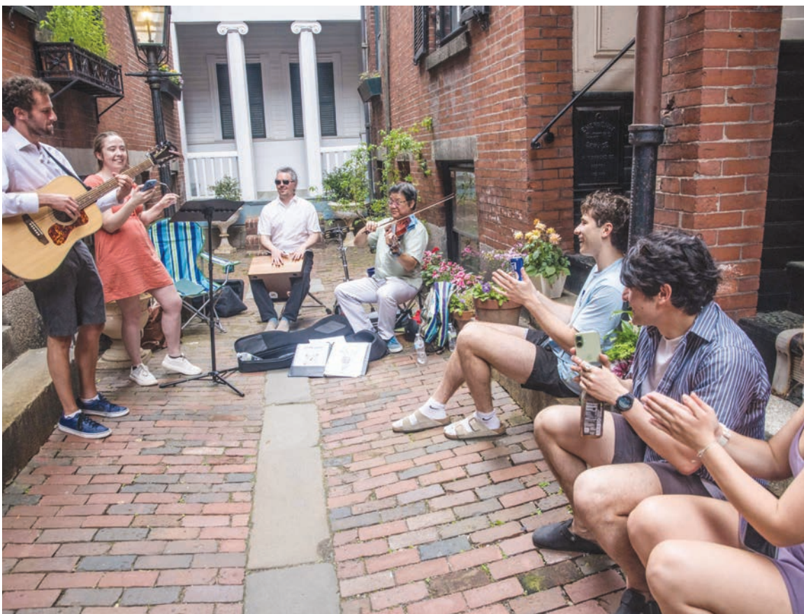
An audience applauds musical performers at Rollins Place.