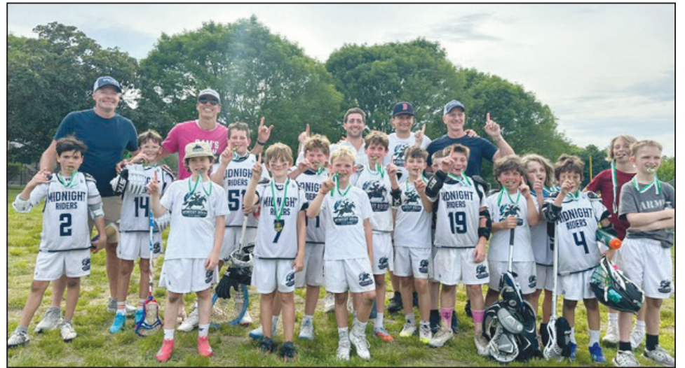
The third and fourth-grade boys are Division Champs.