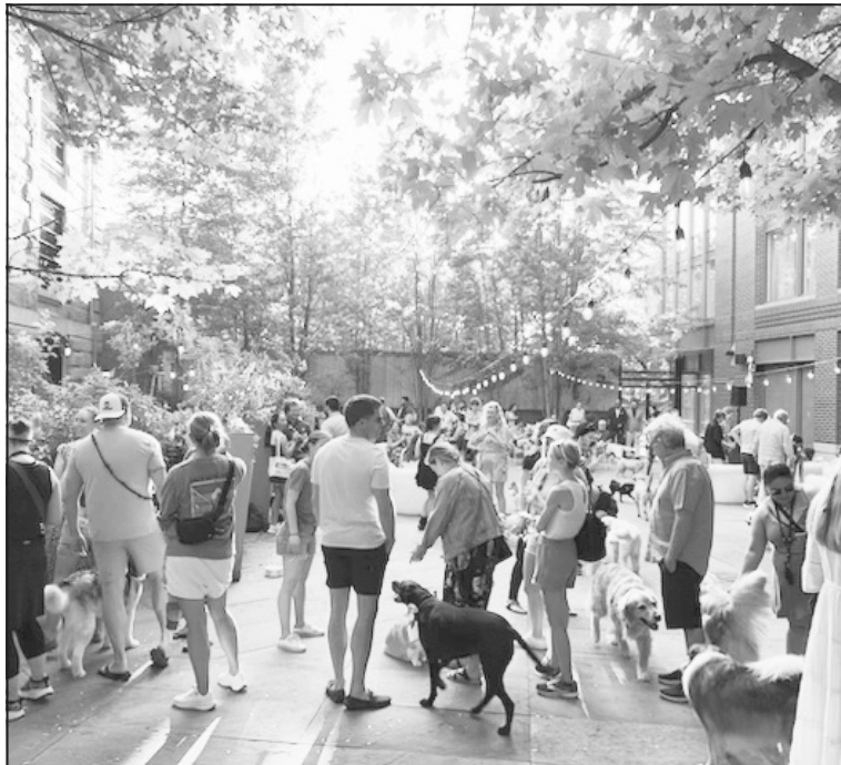
Guests enjoying Yappier Hour at the Liberty.