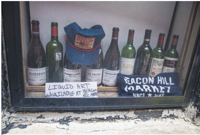
Beacon Hill Market had their own display going in a rear window of their storage room.