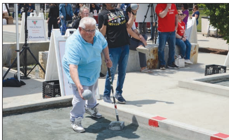
A bocce tournament player sets up shot.

including dental, vision, behavioral health, obstetrics, gynecology, laboratory services and x-ray services. NEW Health is a private, non-profit corporation that is governed by a community-based Board of Directors and licensed by the Department of Public Health. More information at www.newhealthcenter.org , on Facebook, Instagram and Twitter.