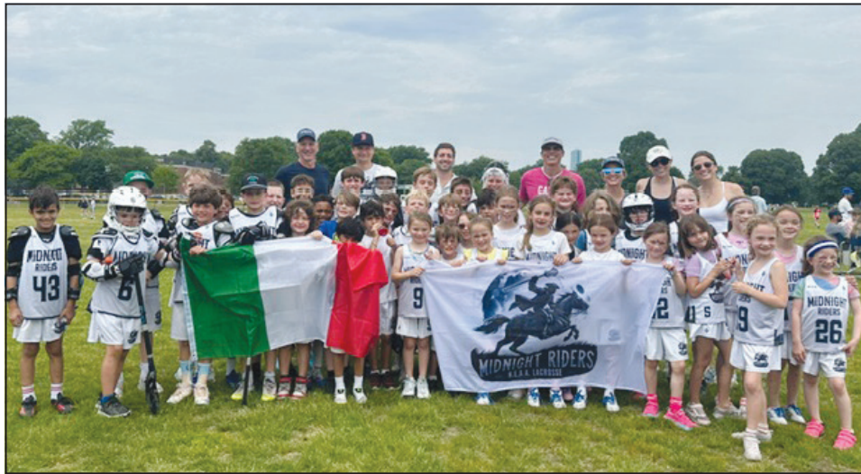
all three teams of the Midnight Riders lacrosse program gather for a photo.