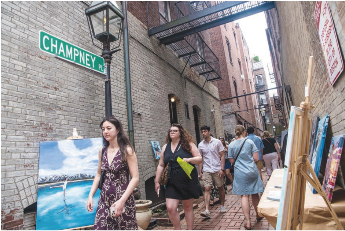
Visitors explore the artist's located at Champney Place.