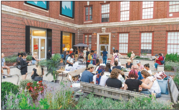
MassArt Art Museum's Art on the Plaza last July.

The MassArt Art Museum (MAAM) announces its Summer 2026 season, featuring a dynamic lineup of free, outdoor programs and community-centered events that celebrate creativity in unexpected places.