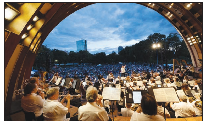
Boston Landmarks Orchestra performs with Boston Lyric Opera on the Hatch Shell last summer.