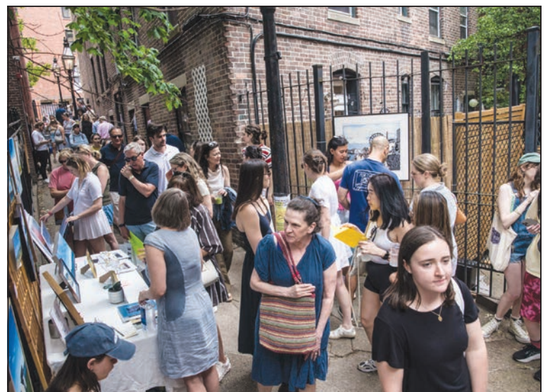
ArtWalk started at the Putnam Avenue alley.