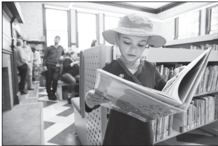
A young reader browses books in the library.