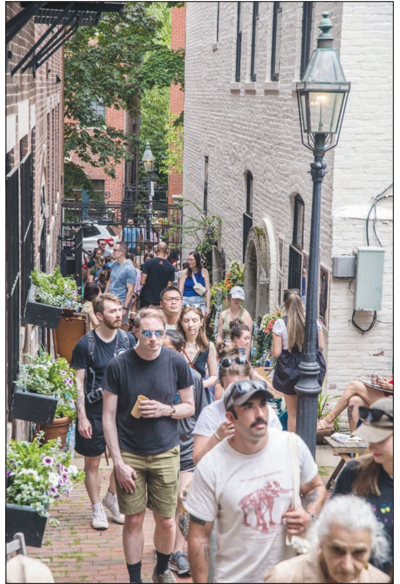
Visitors explore the Primus Ave alley and the artists located there.