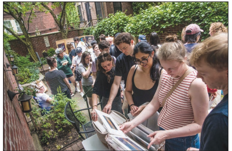
Visitors check out the artists located at Lindall Court.