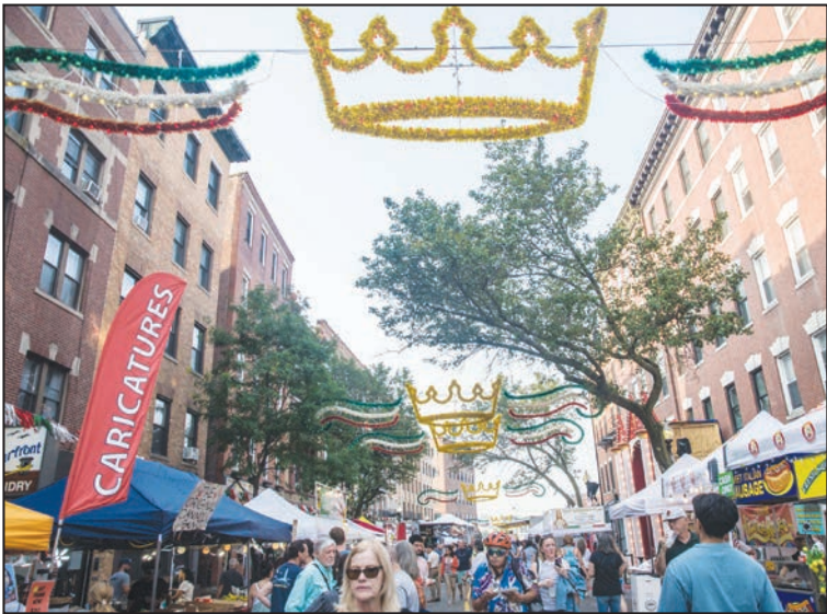
The Saint Agrippina Feast took up residence at the Commercial Street end of Hanover Street.