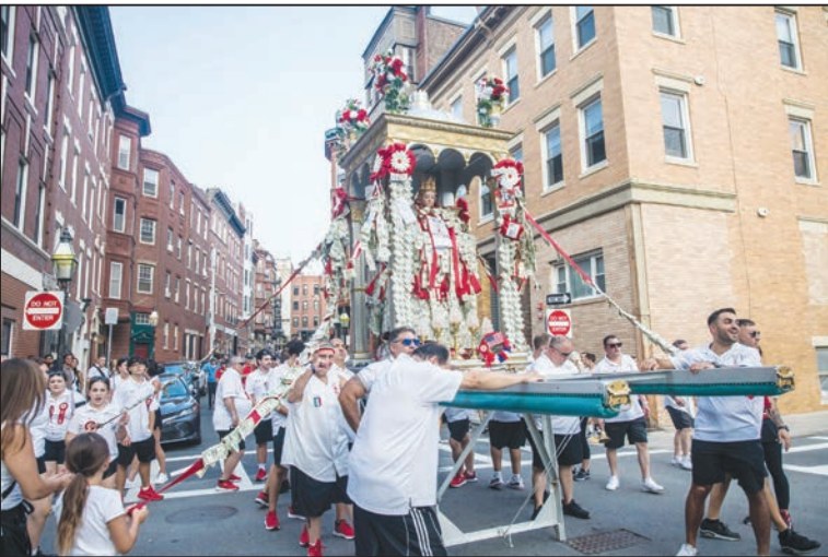
Volunteers bring Saint Agrippina through the winding streets of the North End.