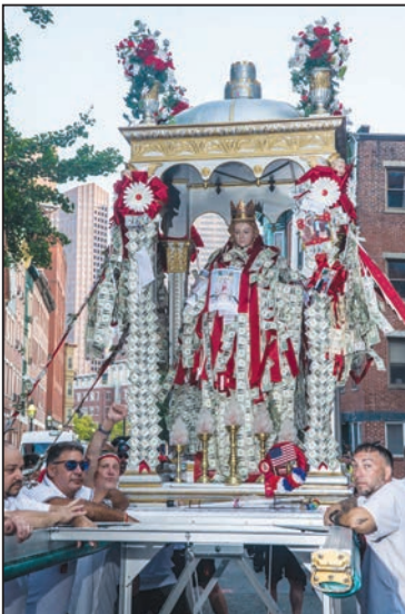
Volunteers bring Saint Agrippina through the winding streets of the North End.