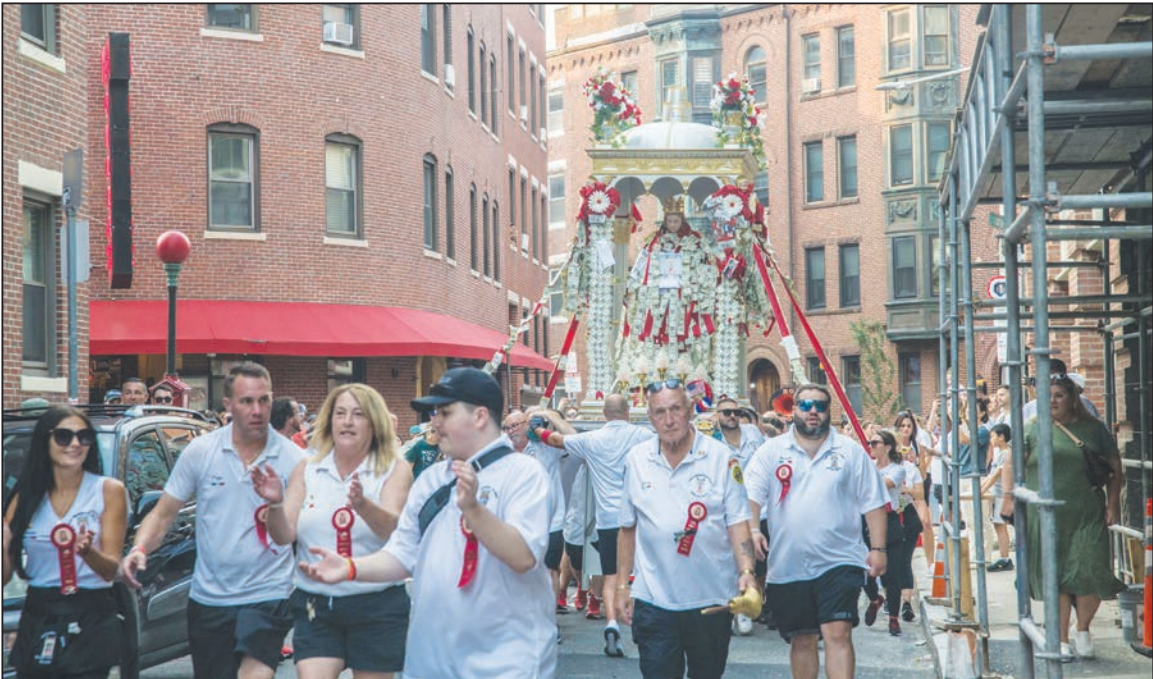
The Saint Agrippina procession marches up North Margin Street.