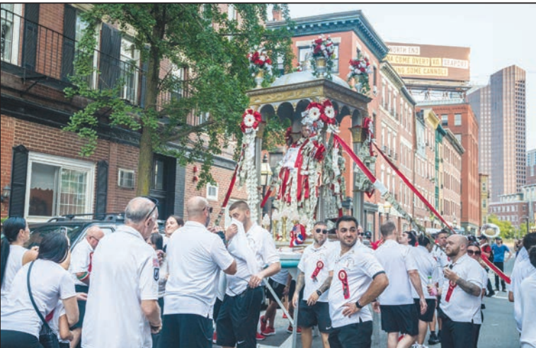
Volunteers bring Saint Agrippina through the winding streets of the North End.