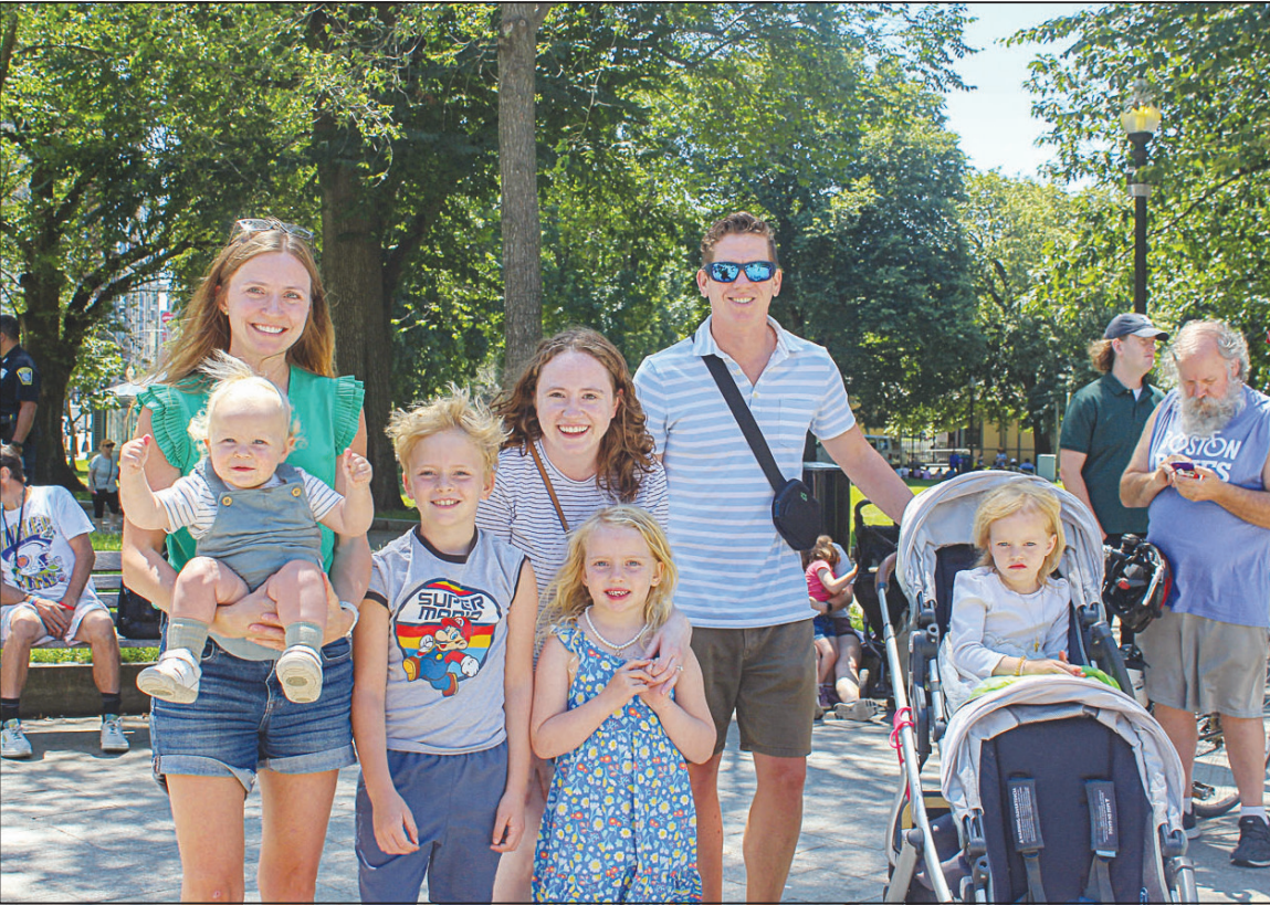
The summertime vibes were high on July 22 at the Friends of the Public Garden's annual Summer Celebration on Brewer Plaza on Boston Common.

For more on the Friends of the Public Garden, visit friendsofthepublicgarden.org .