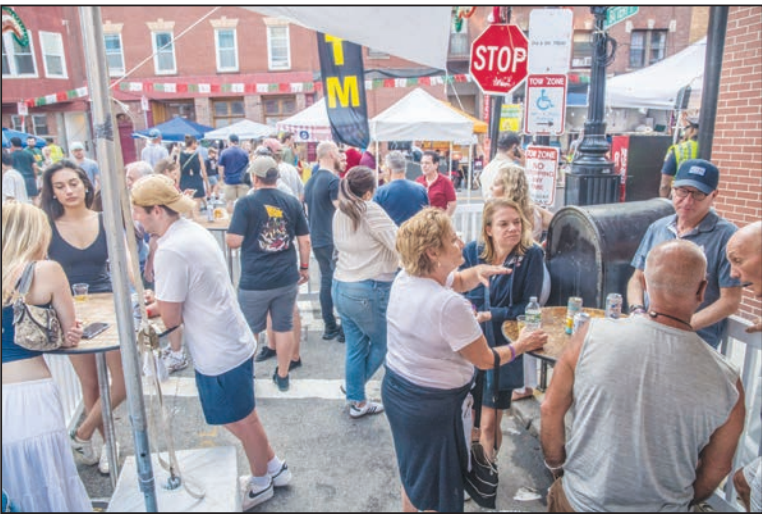
The Peroni Beer Garden had a lot of fun going on.