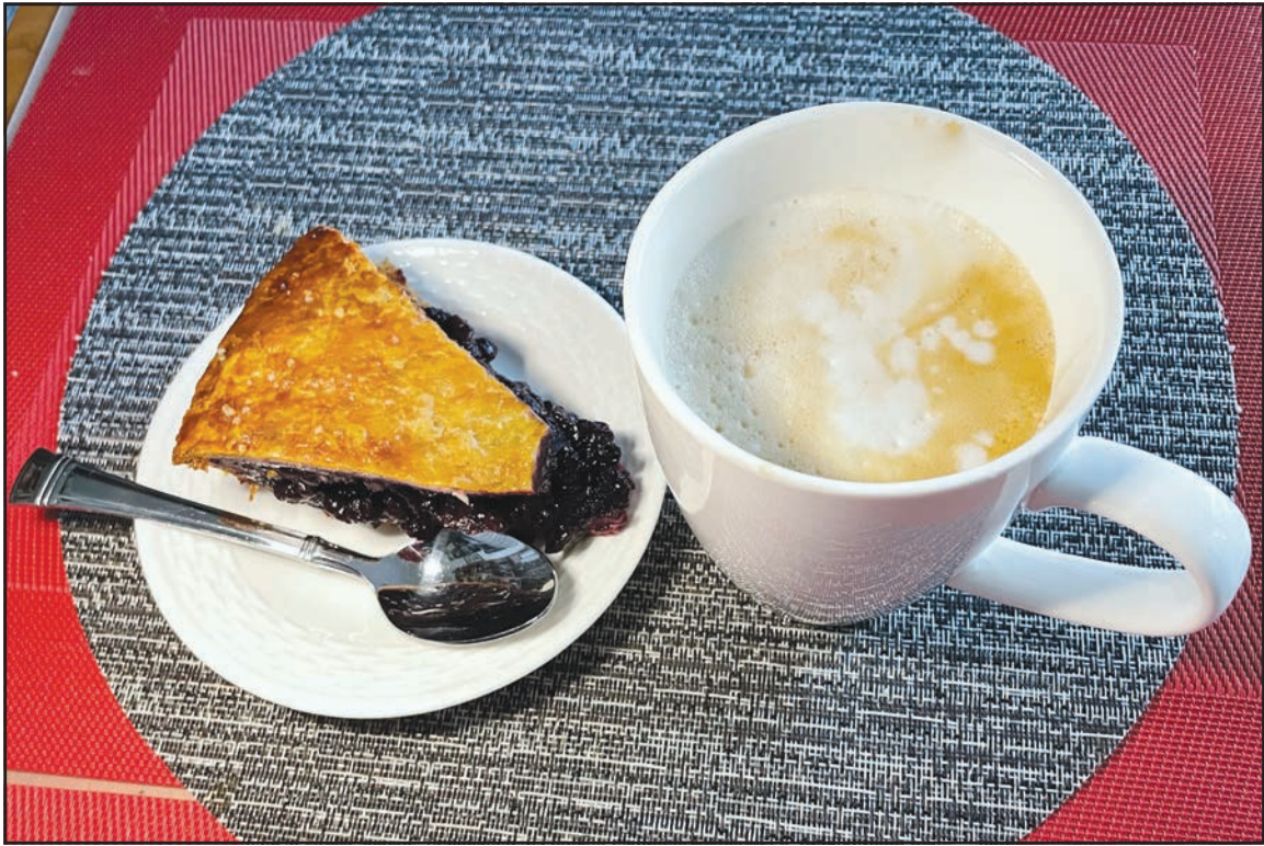
This delicious blueberry pie replaced a birthday cake for Ed. The next day it served as Penny's breakfast.

holds and it was not uncommon to serve pie for breakfast." If you are someone who looks forward to a piece of pumpkin pie on the days after Thanksgiving or a slice of blueberry pie in the morning, you are merely continuing a long tradition. What Counts as Pie? Harbster wrote, "Not only do we have the traditional savory