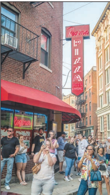
Tourists watch the Saint Agrippina procession at Pizzeria Regina.