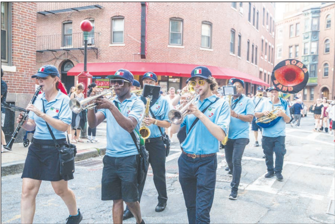
The Roma Band along with the Both End Marching Band provided music for the procession.