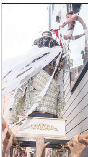
The statue of St. Anthony is raised for a devotee to place an offering on it.