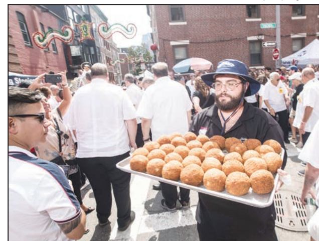
A vendor hurries some riceballs to his stand.