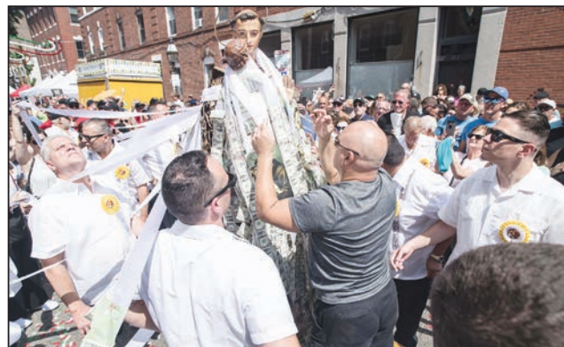
A devotee brings an offering to St. Anthony.