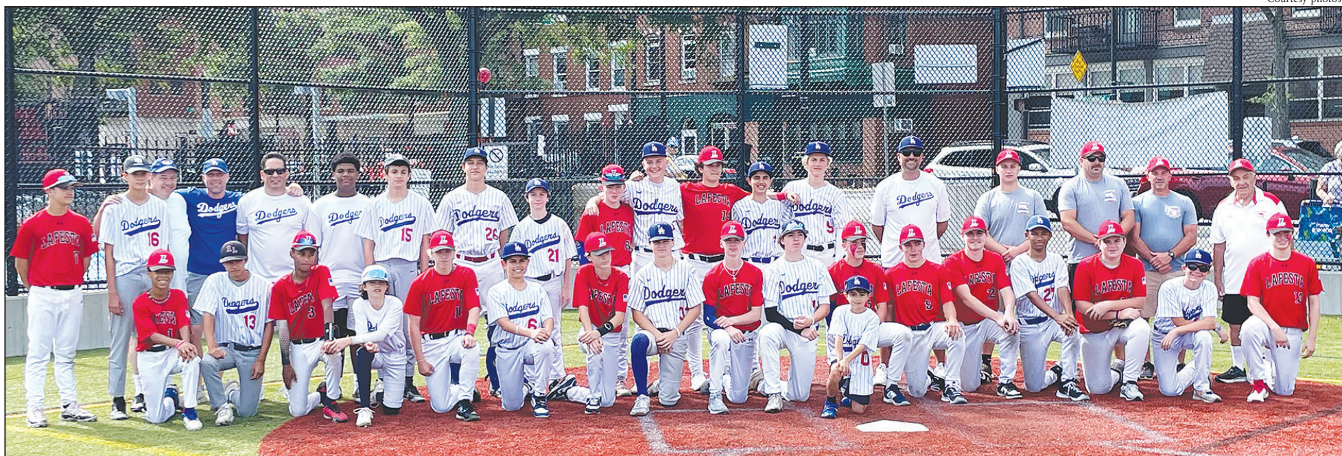
North End Dodgers and North Adams Allstars for LaFesta Baseball Exchange August 10th and 11th Puopolo Park