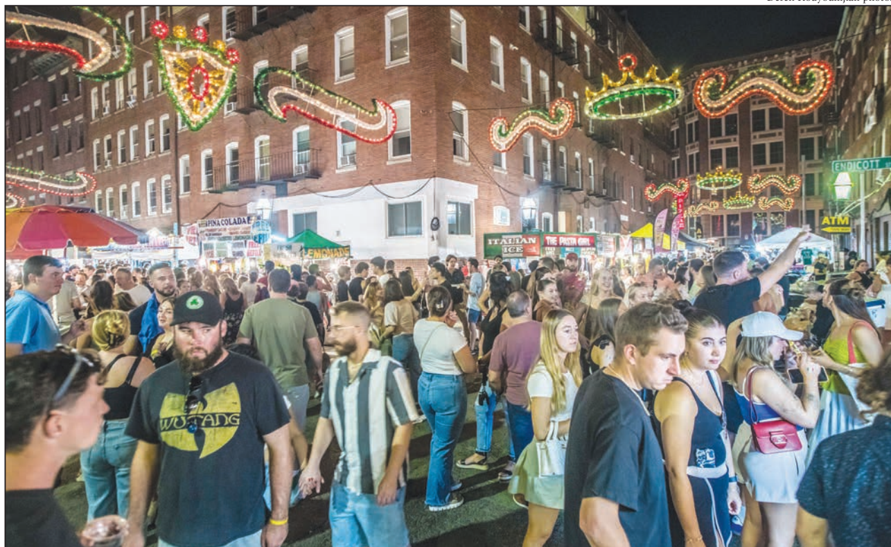
The corner of Thatcher and Endicott Streets was an intersection filled with visitors to St. Anthony's Feast.