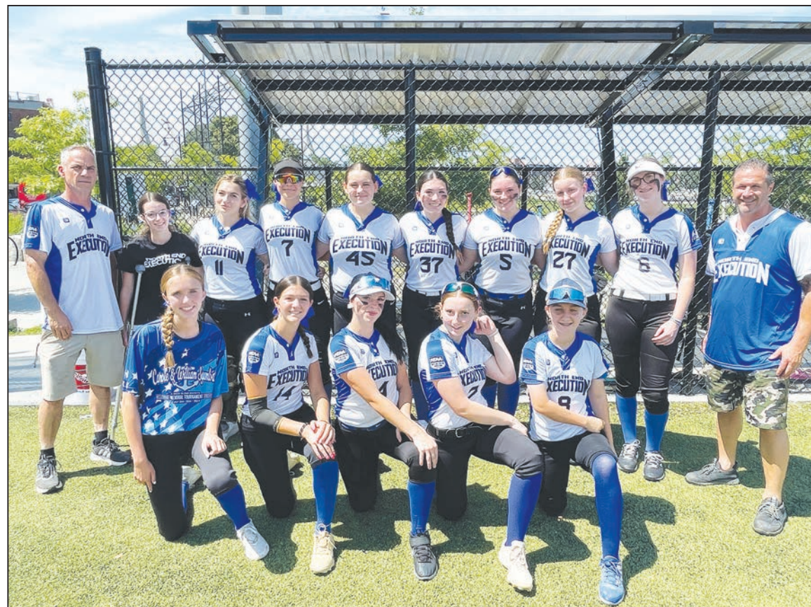
The North End Girls' Softball team