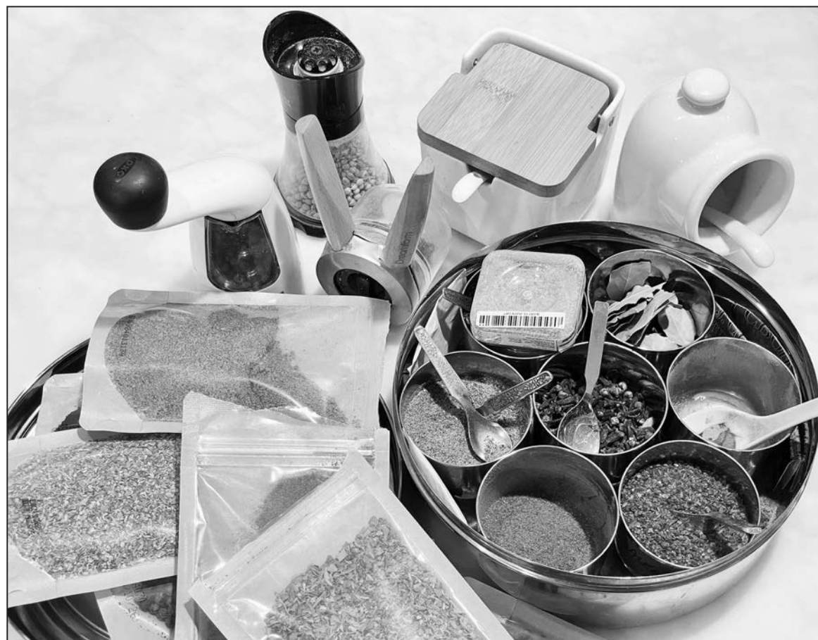
Here are some items from our flavoring collection: small packets of herbs, spices, and blends, salt containers, pepper mills, and a masala dabba filled with Indian food essentials.

Priyadarshini Chatterjee, writing for www.diasporaco.com , said, "On most days, in an ordinary Indian kitchen, the aesthetics of the masala dabba go unnoticed. Its treatment is unceremonious, almost offhand. This apparent nonchalance, however, stems not from irreverence, but instead a deep sense of intimacy and comfort bred by familiarity. The masala dabba is, after all, the sine qua non of everyday cooking in kitchens across the country. Lifting the lid off the masala dabba is often the starting point for every meal turned out of an Indian kitchen —