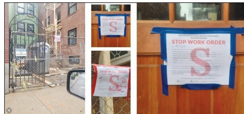
The Stop Work Orders for 190-190A and 4 Snelling place NE Boston.