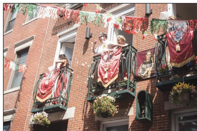
Devotees throw confetti from their apartments above on North Margin Street.