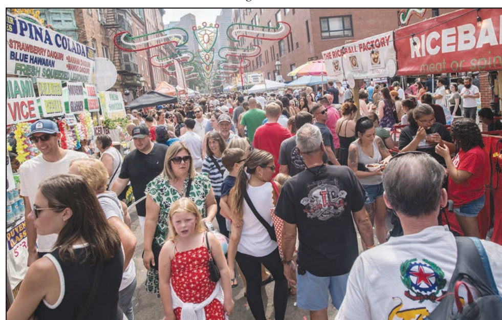
The streets of the North End are filled with visitors and revelry.