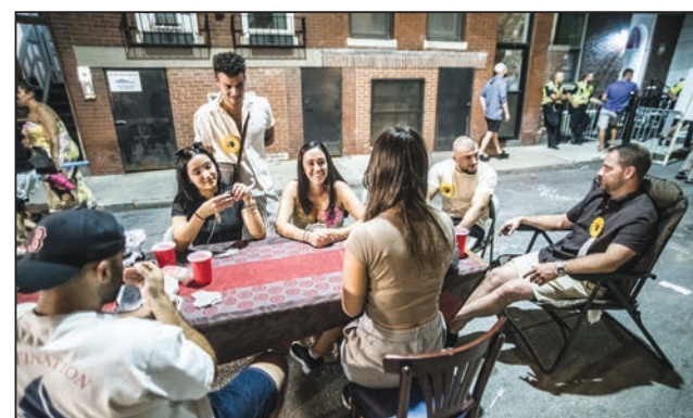
Not far from the festivities, some North End residents celebrate the St Anthony's Feast in a more quiet, but satisfying way.