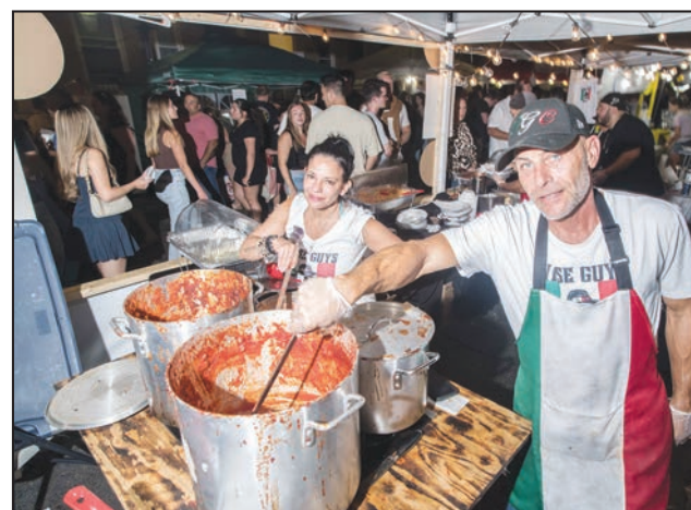
The team at Wise Guys Camolis And Pasta are stirring up some excellent sauce and other foods.