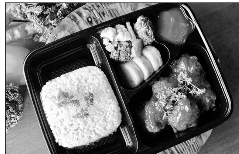
Bento boxes are perfect for making a meal of leftovers, improving visual appeal, and for those who don't like foods touching one another.

A cottage industry of social media accounts competes to show bento box lovers how to design appealing presentations. Some mothers aim to make a packed