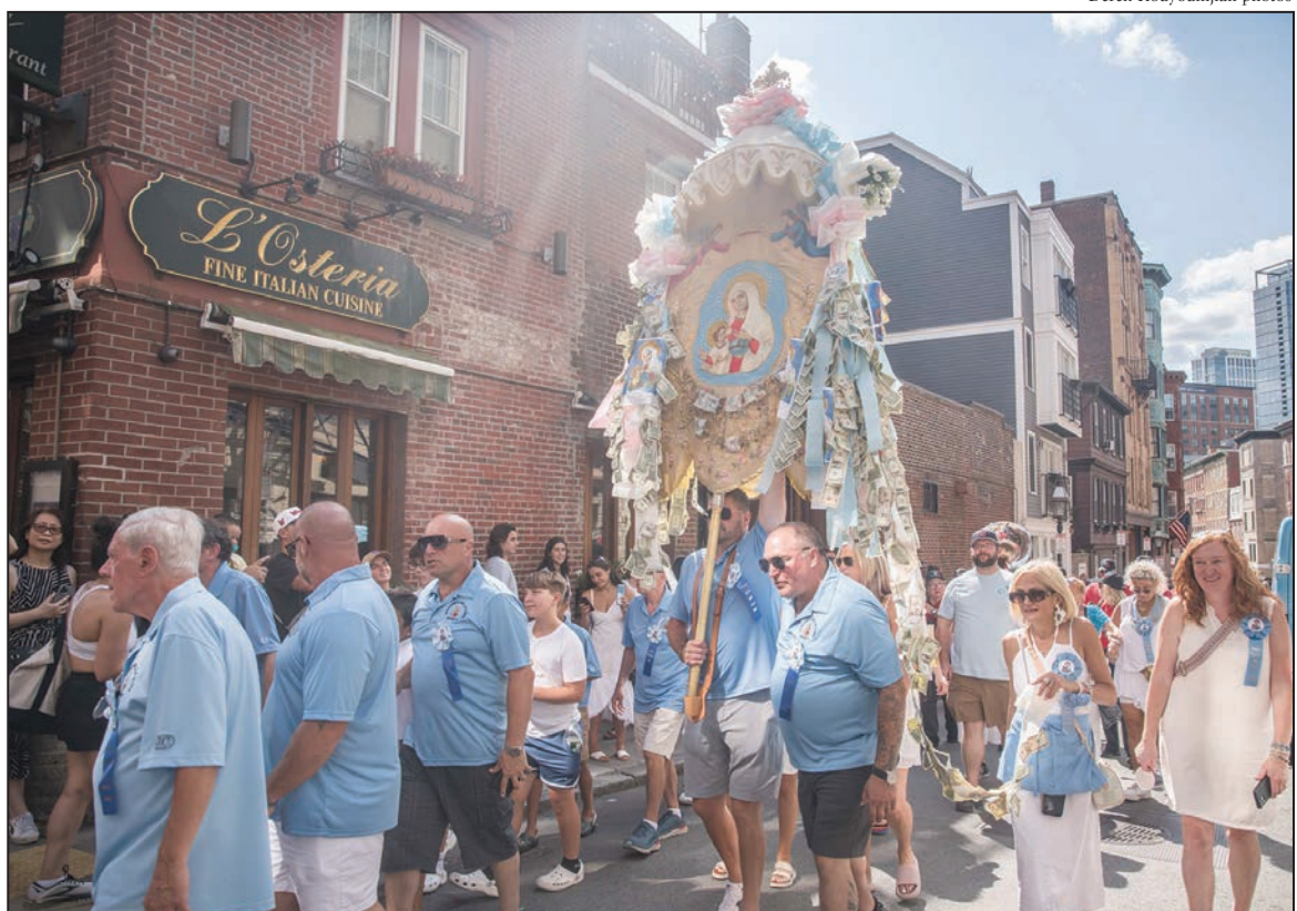
The Madonna is brought onto Salem Street from Cooper Street by L'Osteria.