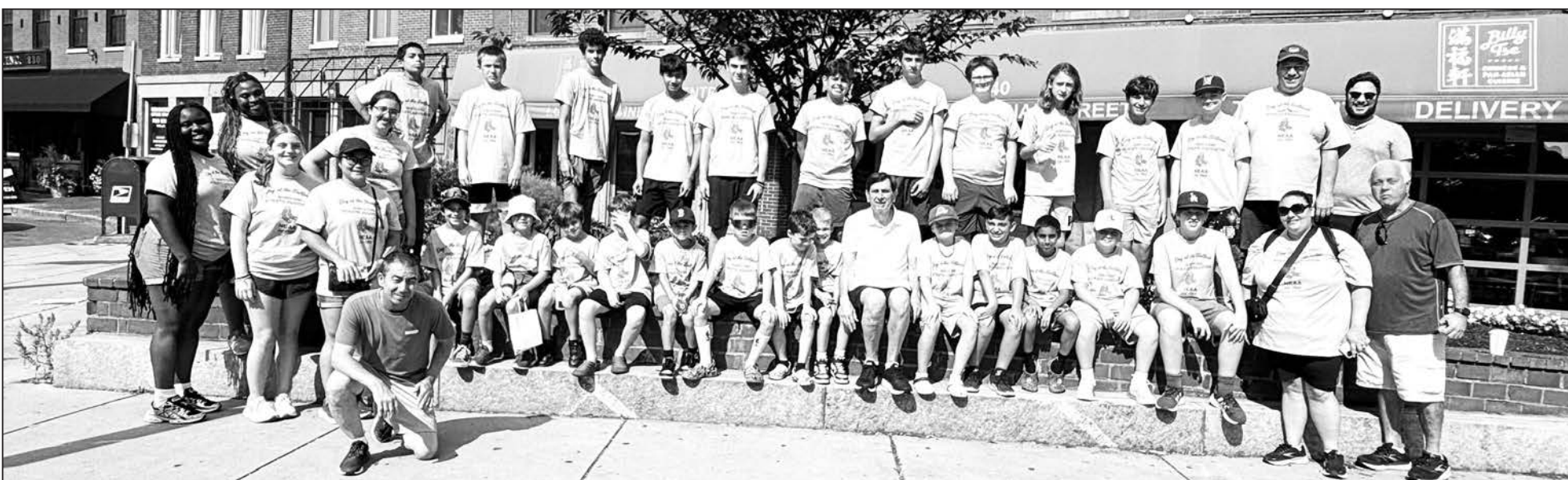
North End and North End summer campers program members.