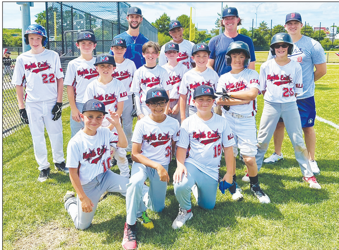
North End Athletic Association's North End team.