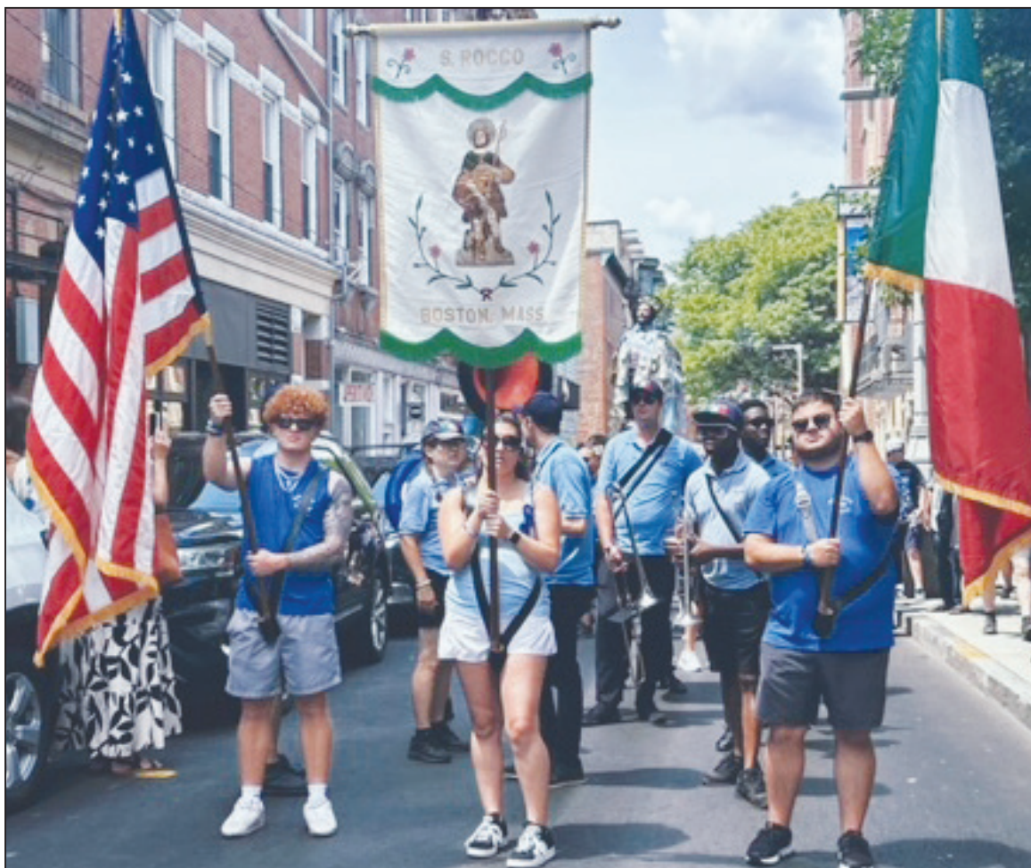
On Sunday July 21, the 103rd Celebration of the San Rocco Society feast.