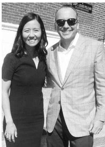
Rep. Aaron Michlewitz, Chair of the House Ways and Means Committee, welcomes Boston Mayor Michelle Wu to the ceremony Tuesday.