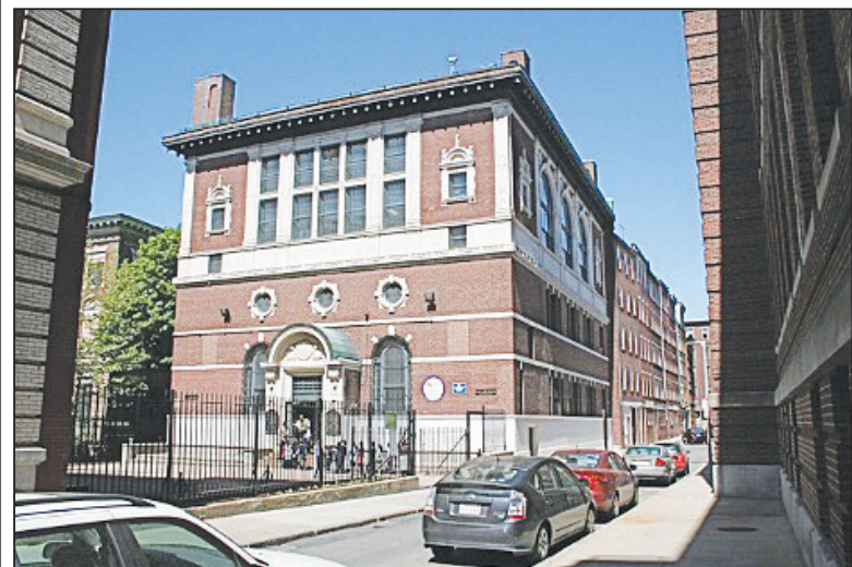
The Nazzaro Center Building on North Bennet Street.