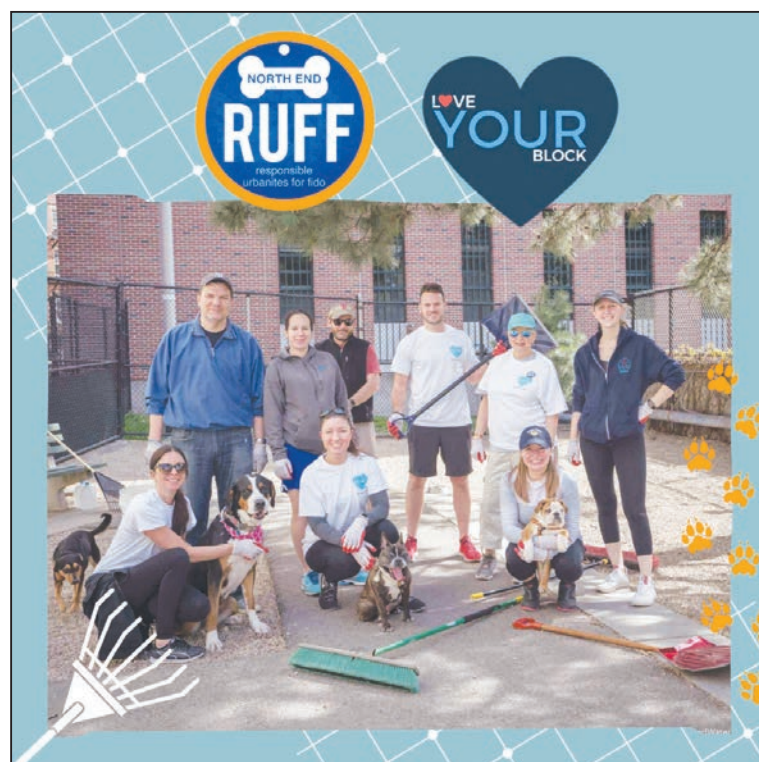
Responsible Urbanites for Fido (RUFF) held another Love Your Park clean-up project at the Richmond Street Dog Run on May 1. Many volunteers masked up and followed all the public safety protocols during the clean-up, which was a success.