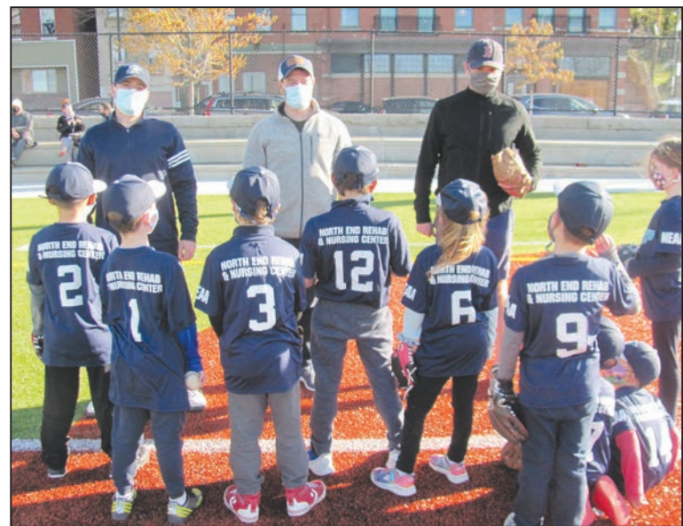
Raptors Sponsors name on back of players shirts