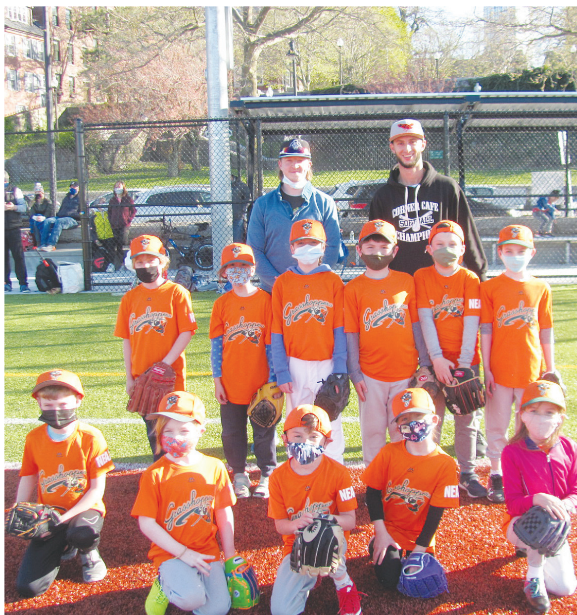
Grasshoppers players and coaches