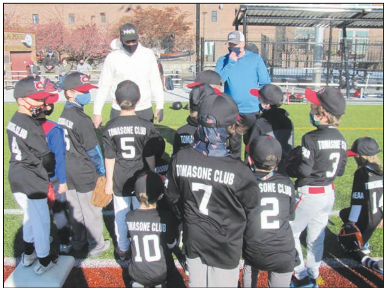
Mud Cats Sponsors name on back of players shirts