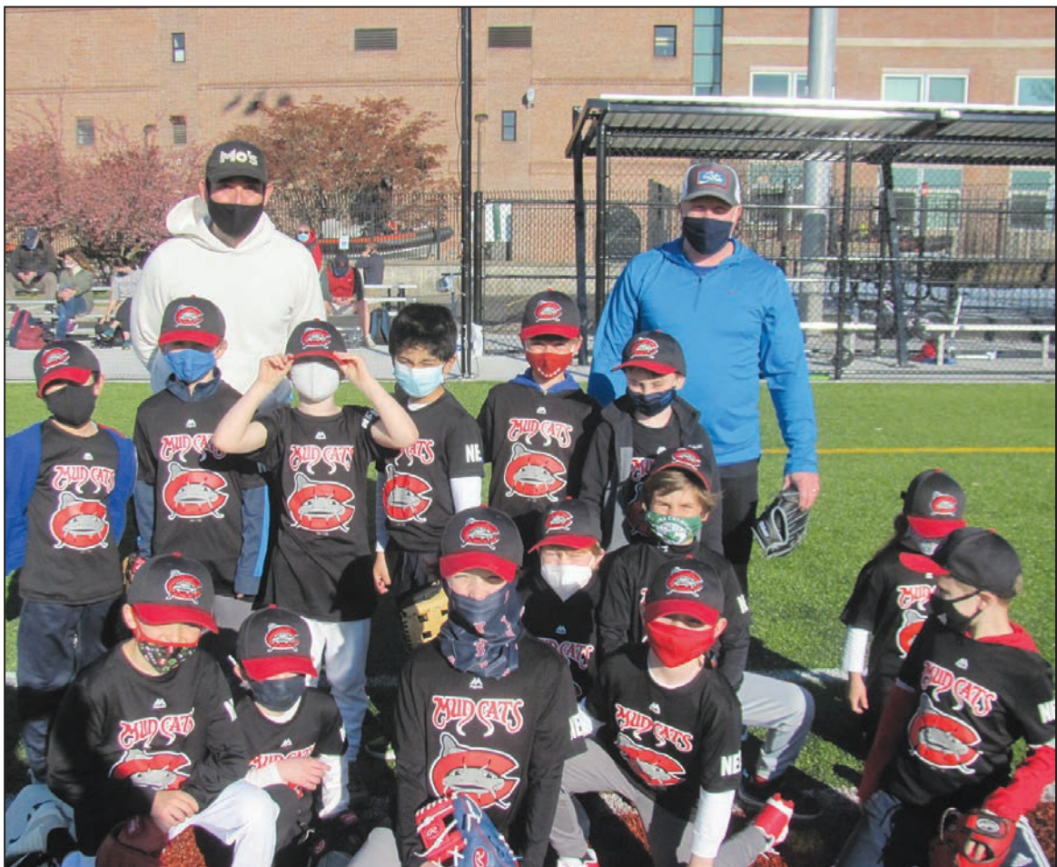
Mud Cats players and coaches