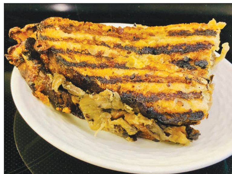
Be on the lookout for sandwiches with a twist like this Mixed Mushroom Melt. It's a panini with roasted mushrooms, gruyere cheese, and caramelized onions from Flour Bakery.

Bring hand sanitizer and wipes. Some of the habits we've added during the pandemic are good and should continue. Pack a cutting