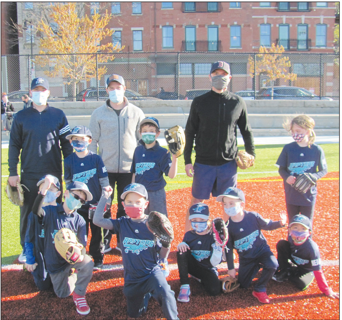
Raptors players and coaches