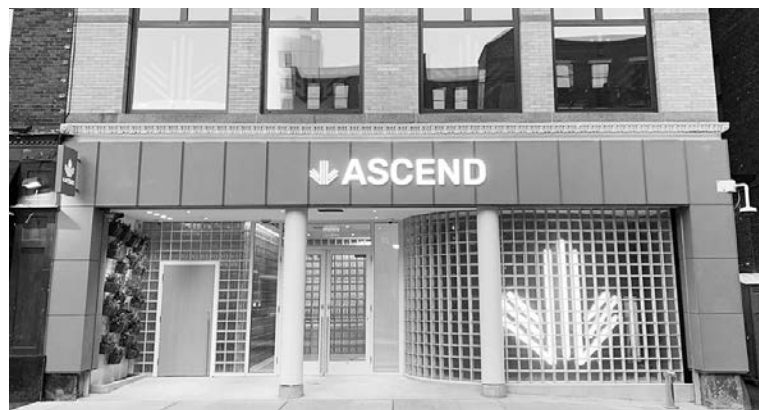
Boston's latest cannabis dispensary, Ascend, opened on Friend Street Wednesday.

The Ascend company is a multi-state cannabis operation serving both medical patients and adult-