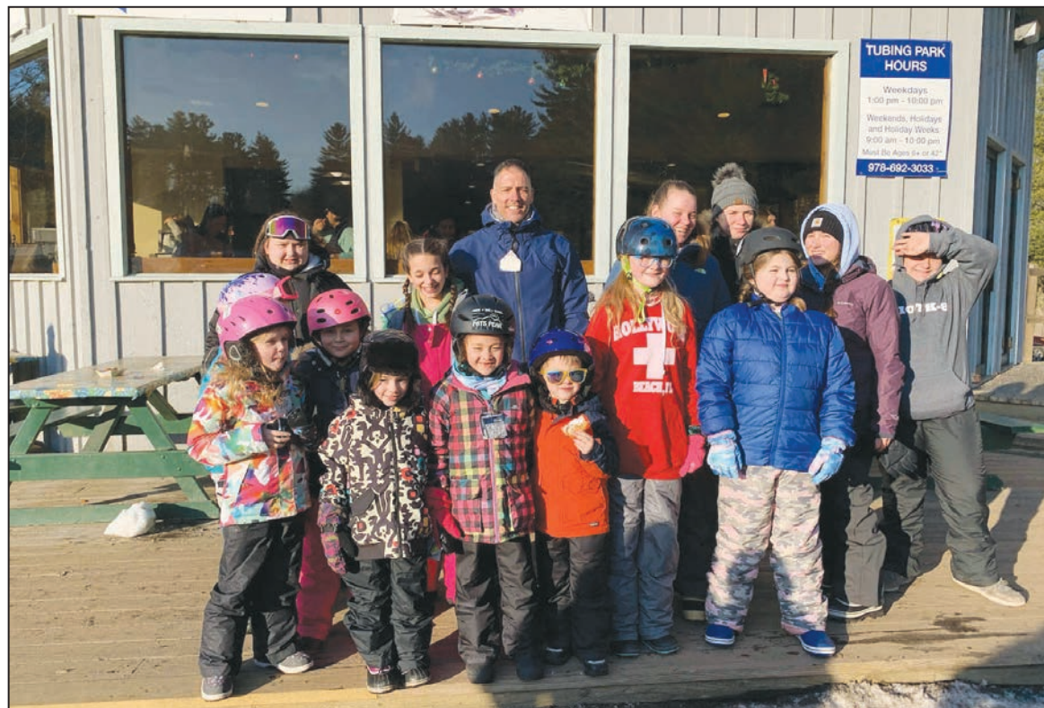
Many North End children turned out for the NEAD day for tubing at Nashoba Valley. See Page 12 for more photos.