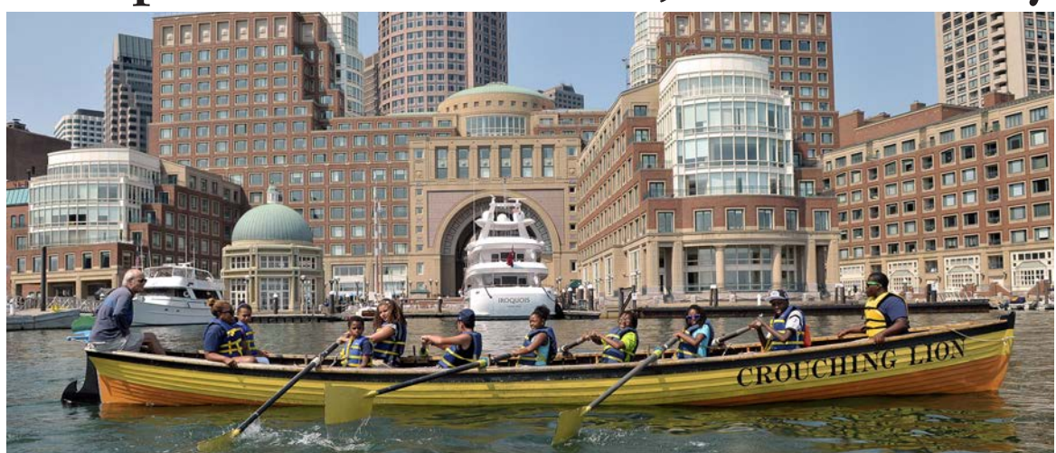
Boston Explorers is a camp that brings kids front and center with the historic sites in the City that often elude those who live here, and it also allows kids to explore their own interests in a non-electronic environment. The camp has grown from 11 to 275 per year since 2011.