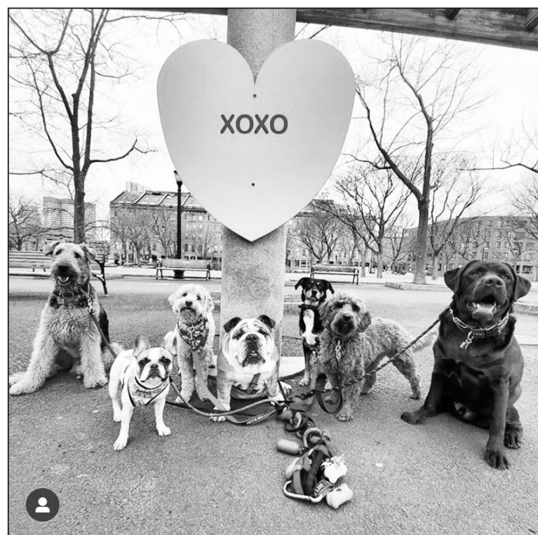
RUFF reminds everyone that dogs must be licensed to enjoy the North End Park. Animal Control does random drop-ins to check for licenses. RUFF will be holding a licensing event in March. Dog licenses are valid from April 1 to March 31 each year.

Each Friday from 3:30 to 4:30 p.m. the North End Library, 25 Parmenter Street hosts a Team