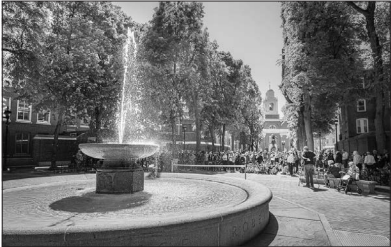
The fountain is once again fully operational for the season.