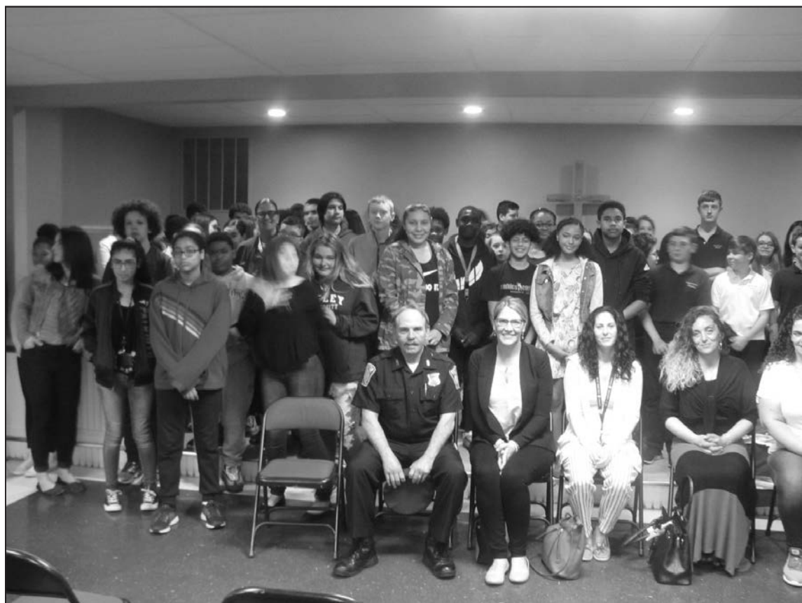
Students and organizers gather at the end of the event.