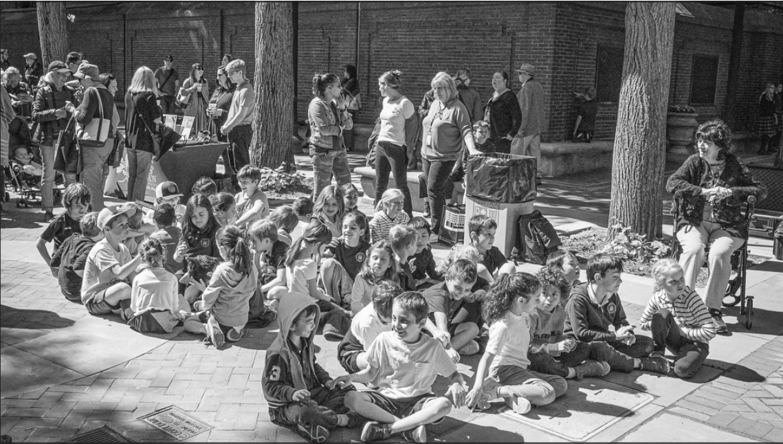
Children enjoy the re-opening of the park.