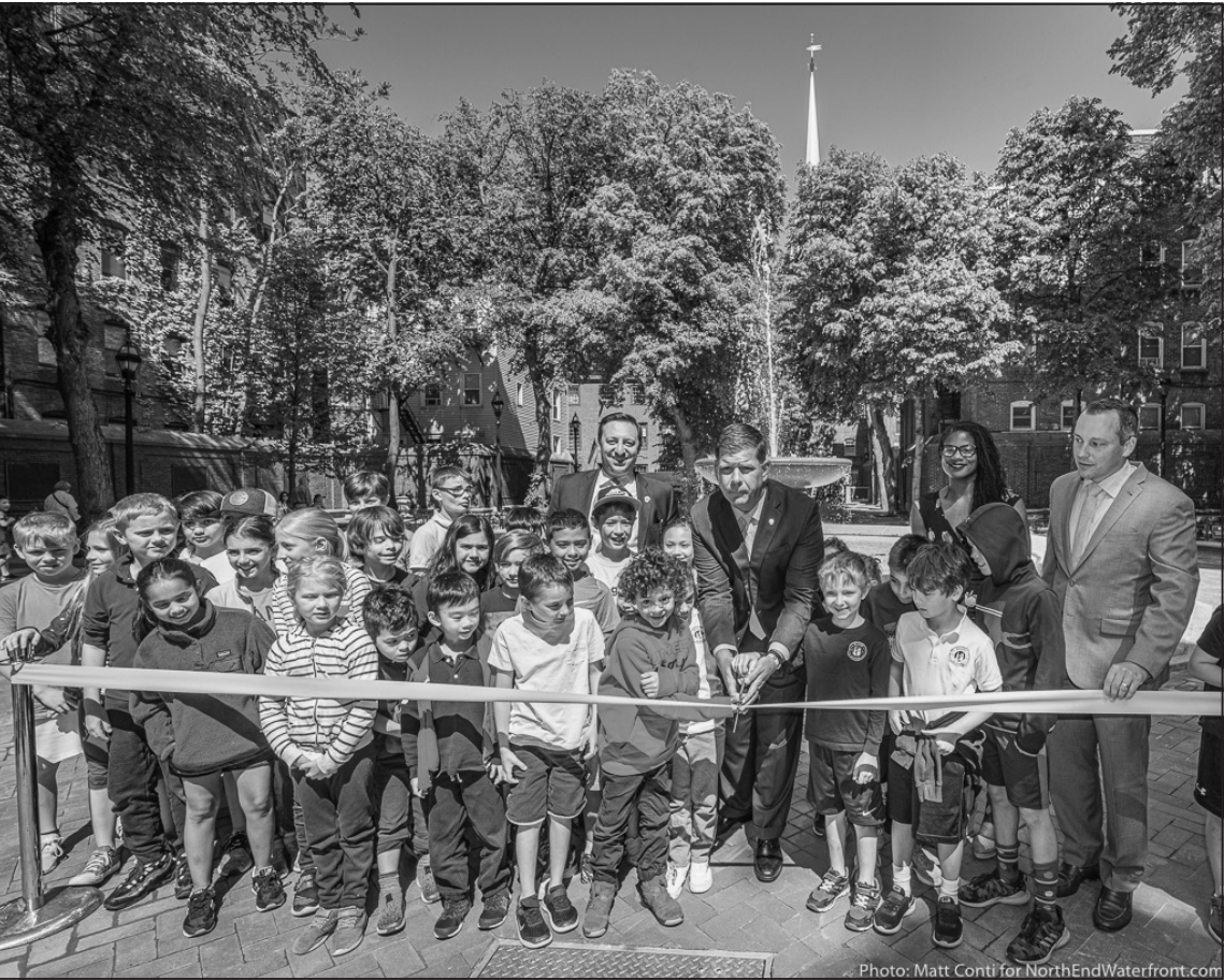
Mayor Walsh cuts the ribbon to open the Park.