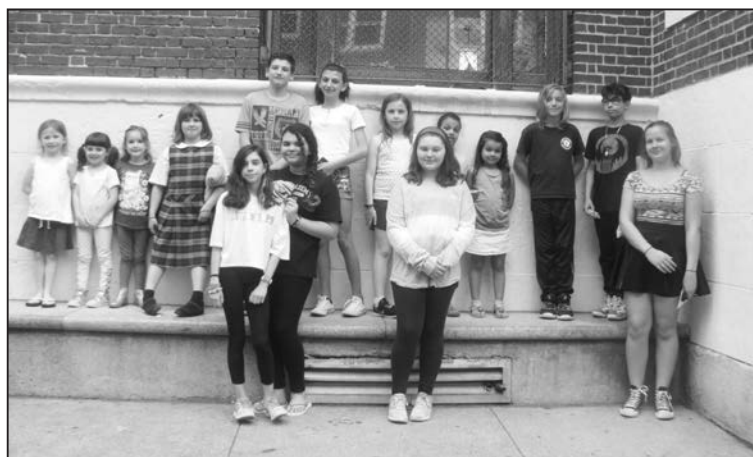
Some of the scholarship recipients