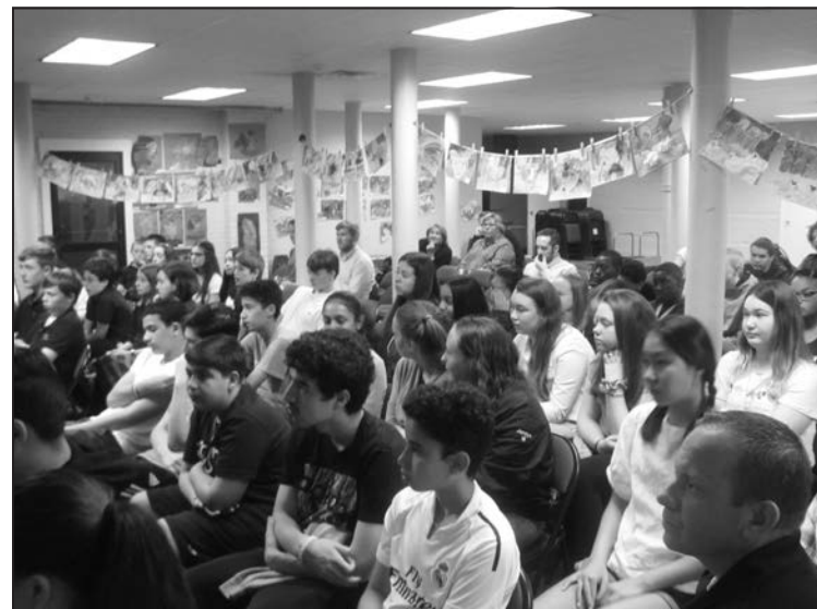
Crowd of Students at Event.