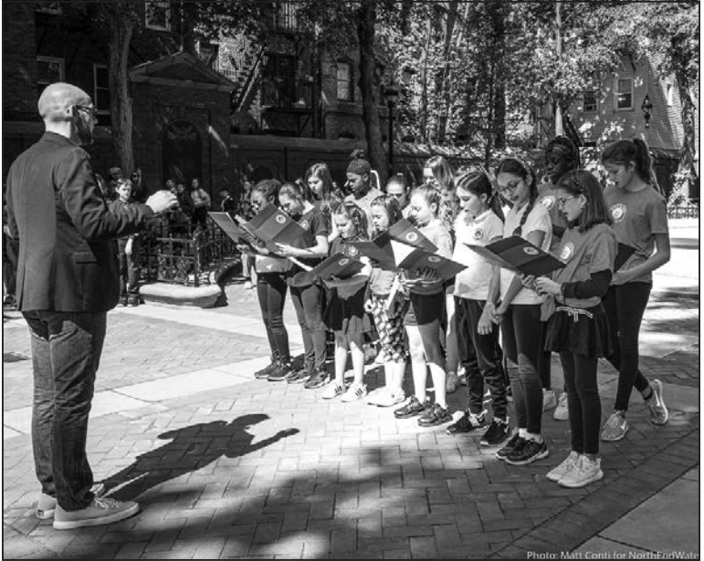
A choral group performs