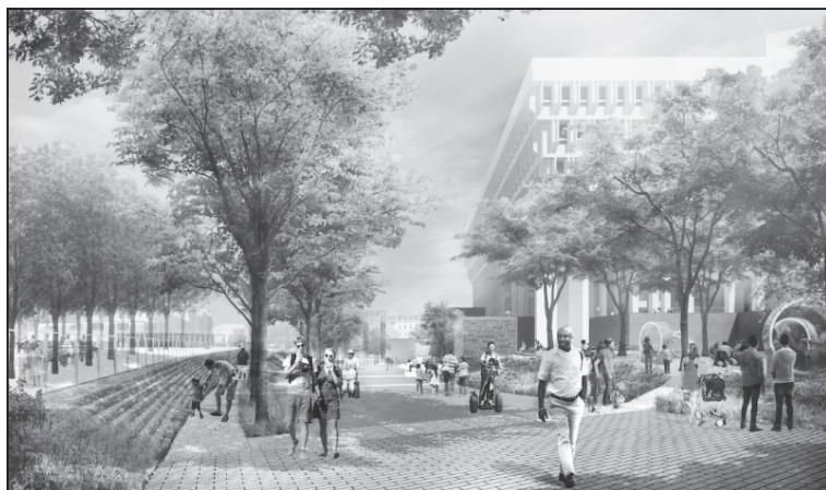
City Hall Plaza Concept Design.