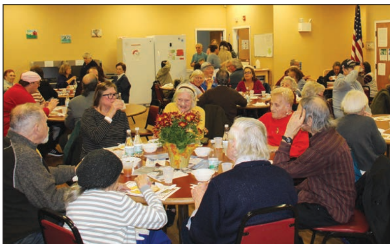
The ABCD North End/West End Neighborhood Service Center (NE/WE NSC) held its annual Thanksgiving luncheon on Friday, Nov. 16. Those who attended were served with a full Thanksgiving spread. Close to 70 seniors attended the luncheon. See more photos on Page 7.