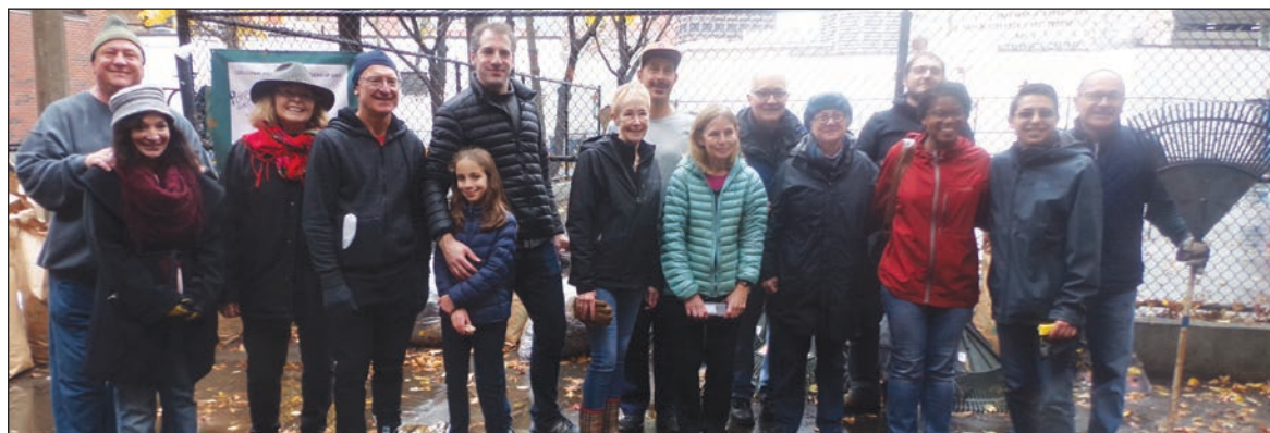
Cuttillo Park cleanup volunteers.

Department and the newly formed Friends of Cuttillo Park community group, the cleanup went well with many bags of leaves and debris removed from the public park.