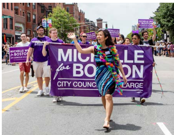
Boston City Councilor Michelle Wu during the 48th Boston Pride Parade.