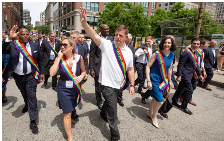
Boston Mayor Martin J. Walsh leading around 100 mayors from other U.S. cities on Clarendon Street during the 48th Boston Pride Parade. Mayors from all over the U.S. were on hand for the Conference of Mayors, and many chose to march with Walsh.