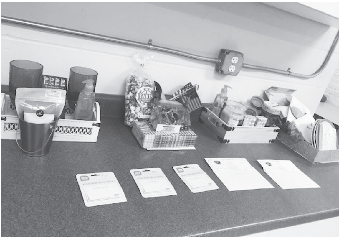
Boston Harborside Funeral Home sponsored a North End Seniors Bingo at the Nazzaro Center. They presented 10 prizes, one for each game (5 gift baskets and 5 gift cards). The seniors were grateful for the Bingo and the prizes.