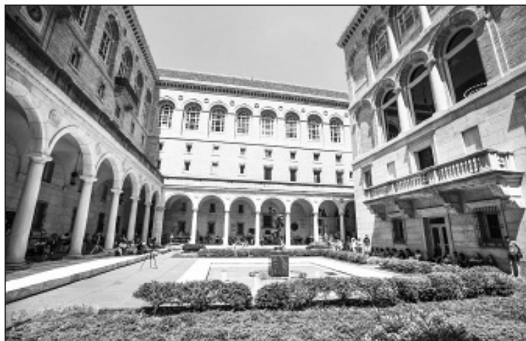
Boston Public Library Courtyard

Boston Youth Symphony Orchestras, Saturday, July 21, 12:30 p.m.