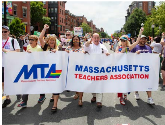
The Massachusetts Teachers Association.