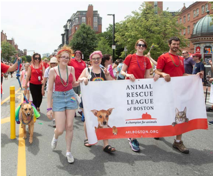
The Animal Rescue League marched with several canine and feline friends.

The 48th Boston Pride Parade took place on Saturday. Thousands marched from Copley Square and ended at City Hall Plaza. This year's theme was "Rainbow Resistance."