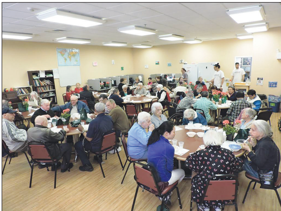
Over 40 mothers came out along with their families to the Mother's Day celebration at the North End/West End Neighborhood Service Center.