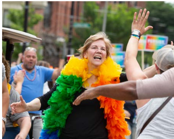
Senator Elizabeth Warren (D-MA) during the 48th Boston Pride Parade.