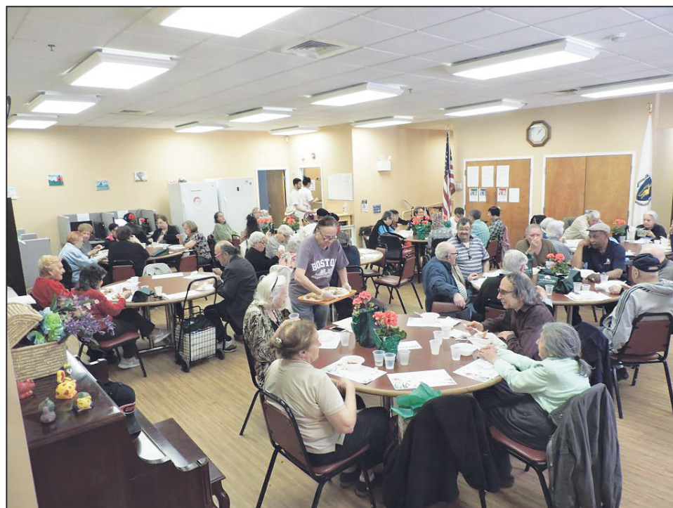
Guests enjoy the Mother's Day celebration.