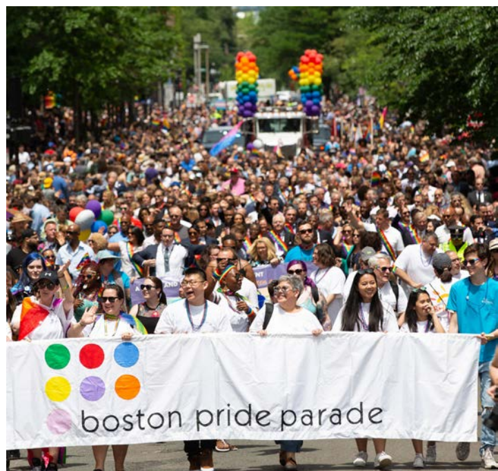
The 48th Boston Pride Parade, marching on Clarendon Street.