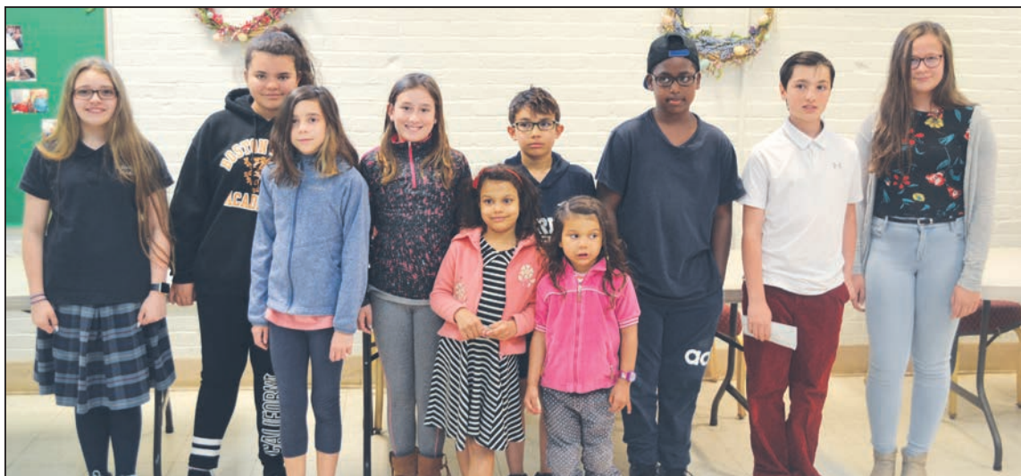
Some of the NEAD Scholarship recipients.